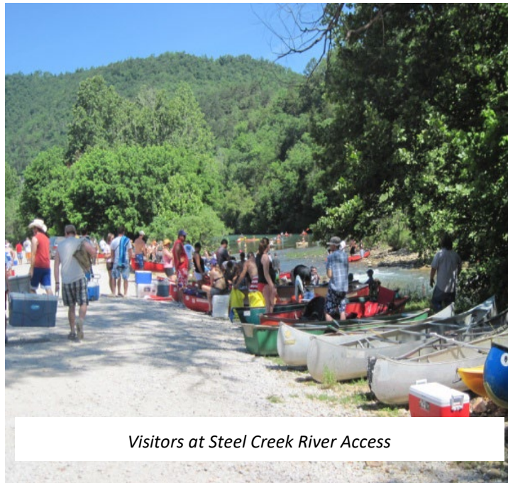
Visitors at Steel Creek River Access