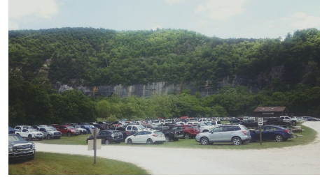
Exhibit 7. Potential Concessioner Impacts on Park Resources

The mission of the National Park Service includes protecting, conserving, and preserving park resources. Exhibit 8 describes resources that the concession operations most likely will affect. Exhibit 8 is not intended to be exhaustive but instead focuses attention on effects that are particularly important to the Park.