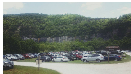
Exhibit 7. Potential Concessioner Impacts on Park Resources

The mission of the National Park Service includes protecting, conserving, and preserving park resources. Exhibit 8 describes resources that the concession operations most likely will affect. Exhibit 8 is not intended to be exhaustive but instead focuses attention on effects that are particularly important to the Park.