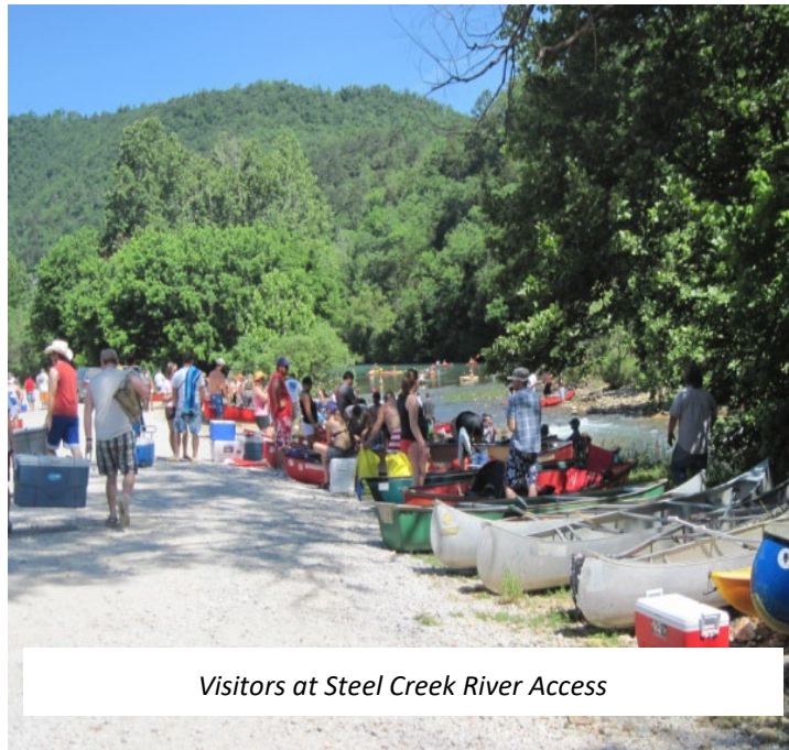
Visitors at Steel Creek River Access