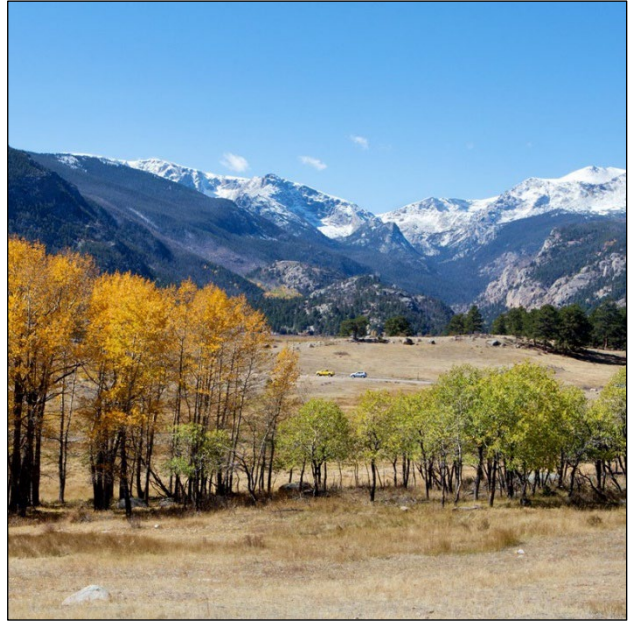
View of Moraine Park Area

The mission of the National Park Service at Rocky Mountain National Park is rooted in and grows from the park's enabling legislation as established by an Act of Congress in 1915. Containing over 265,800 acres, the park was set-aside as "...a public park for the benefit and enjoyment of the people...and for the preservation of the natural conditions and scenic beauties thereof."