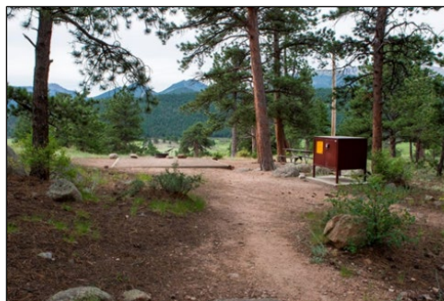
Visitor Campsite at Moraine Park Campground