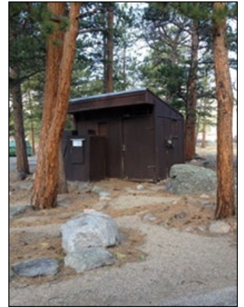
Firewood sales area at Moraine Park Campground

The following describes the Required Services (i.e., must be provided by the Concessioner), Authorized Services (i.e., may be provided at the option of the Concessioner), and service locations as described in the Draft Contract. The required and authorized services under this business opportunity are not materially changed between the Previous Contract and the Draft Contract; however, in the Draft Contract, staffed sales are no longer a required service .