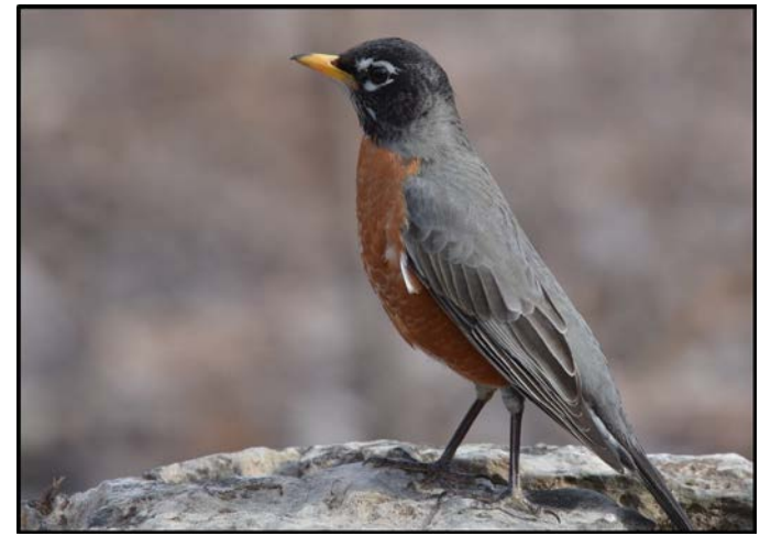
Figure 2. Although currently found at the Recreation Area, suitable climate for the American Robin ( Turdus migratorius ) may cease to occur here in summer by 2050, potentially resulting in local seasonal extirpation.

important refuge for 14 of these climate-sensitive species, one, the Mallard ( Anas platyrhynchos ), might be extirpated from the Recreation Area in summer by 2050.