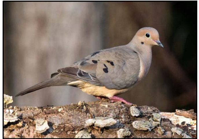
Figure 2. Climate at the Monument in summer is projected to remain suitable for the Mourning Dove ( Zenaida macroura ) through 2050.

While the Monument may serve as an important refuge for 4 of these climate-sensitive species, one, the Red Crossbill ( Loxia curvirostra ), might be extirpated from the Monument in summer by 2050.