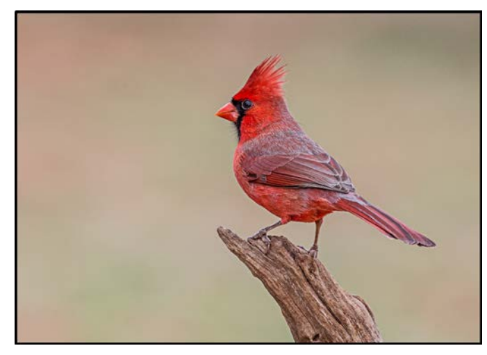
Figure 2. Climate at the River in summer is projected to remain suitable for the Northern Cardinal ( Cardinalis cardinalis) through 2050.

climate is not projected to disappear for these 15 species at the River; instead the River may serve as an important refuge for these climate-sensitive species.