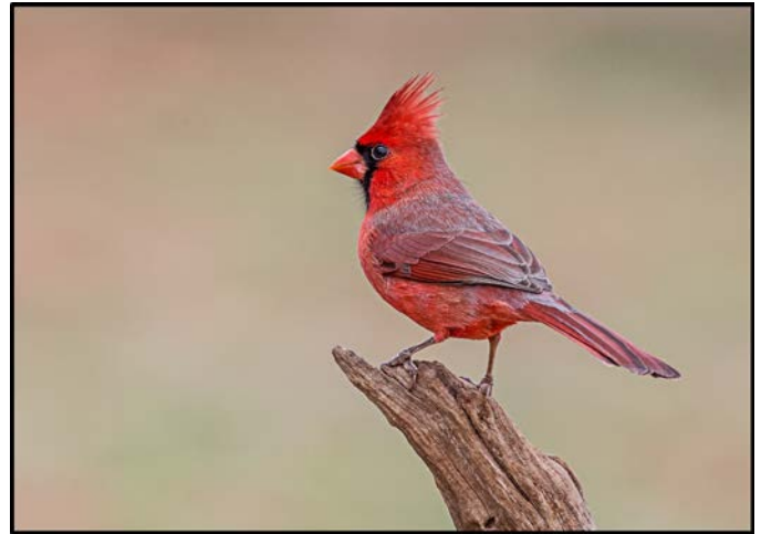
Figure 2. Climate at the River in summer is projected to remain suitable for the Northern Cardinal ( Cardinalis cardinalis ) through 2050.

River may serve as an important refuge for 7 of these climate-sensitive species, one, the Mallard ( Anas platyrhynchos ), might be extirpated from the River in summer by 2050.