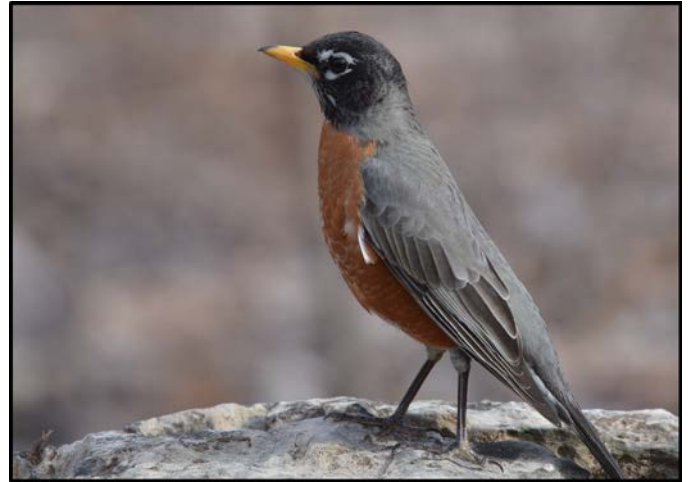
Figure 2. Climate at the Park in summer is projected to remain suitable for the American Robin ( Turdus migratorius ) through 2050.

Park may serve as an important refuge for 13 of these climate-sensitive species, 2 might be extirpated from the Park in at least one season by 2050.