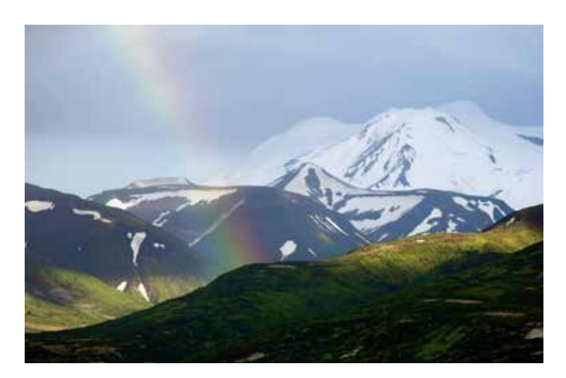
Mt. Mageik www.nps.gov/katm

Katmai NP&P is committed to teaching employees the importance of living more sustainably especially in an area where obtaining general supplies like groceries can have such a huge impact on resource consumption. Katmai's education and communication program is still in its infancy, but is taking shape through all-employee meetings; park-wide training sessions and will eventually evolve to include a monthly newsletter that highlights past and upcoming sustainability events and accomplishments within the park and greater region as well as sustainability tips. The newsletter will be emailed to all employees and posted around the King Salmon headquarters.