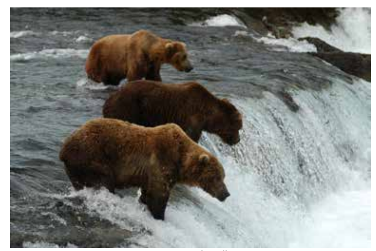
Bears on Brooks Falls www.nps.gov/katm

As a participant in the National Park Service (NPS) Climate Friendly Parks (CFP) program, Katmai National Park and Preserve (NP&P) belongs to a network of parks nationwide that are putting climate friendly behavior at the forefront of park operations and resource management. As part of this program, Katmai NP&P has conducted a greenhouse gas (GHG) emission inventory, participated in a climate change and sustainability educational workshop, set climate change mitigation and GHG emission reduction goals, and integrated these actions into a park-wide Environmental Management System (EMS).