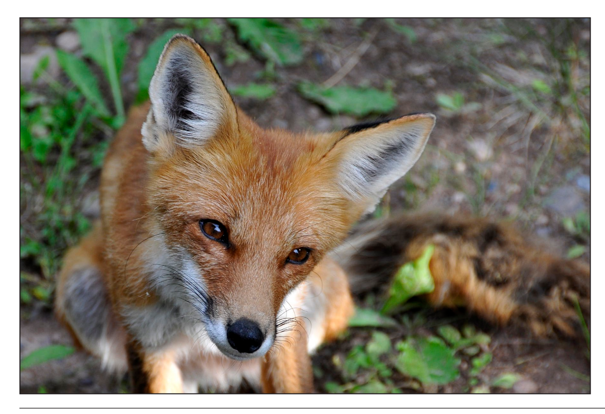
Red Fox at Isle Royale National Park.

The interrelationships and interactions between natural and anthropogenic processes pose immense challenges for land managers tasked with resource stewardship. The future of Isle Royale will not be a replica of the past; some ecosystem components will remain while others will disappear as new elements arise. Resource stewardship on Isle Royale and across all National Parks must adhere to public policy and regulation, reflect the long-term public interest, and be based on the best available science (Colwell et al. 2012). For Isle Royale, this means acknowledging past ecosystem components and dynamics while simultaneously looking towards a future that harbors both expected changes and many uncertainties. Together with other sources, information from the climate projections and scenarios developed in this workshop will serve to inform adaptation strategies for Isle Royale.