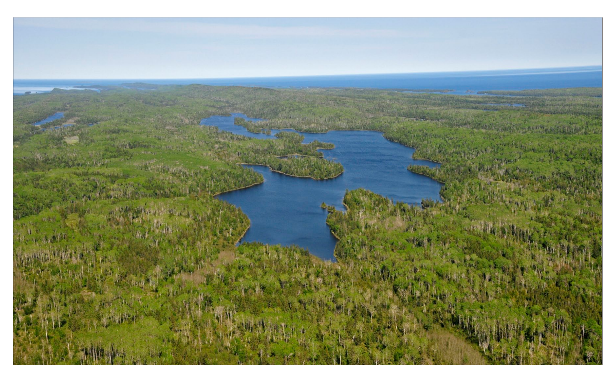
Isle Royale National Park wilderness; NPS photo.

Vegetation, wildlife, and environmental variables, such as climate, have complex and dynamic relationships. Comprehensive, longterm studies of climate, forest dynamics, and the wolf-moose-vegetation system on Isle Royale provide a broader understanding of ecosystem change, trophic interactions, and how the importance of drivers can vary over time (Kraft et al. 2010). Past dynamics and the relative roles of various biotic and abiotic drivers inform our understanding of the plausible rates and direction of ecosystem change in the near future.