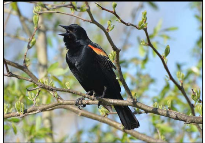
Figure 2. Climate at the Site in summer is projected to remain suitable for the Red-winged Blackbird ( Agelaius phoeniceus ) through 2050.

serve as an important refuge for 3 of these climate-sensitive species, 2 might be extirpated from the Site in at least one season by 2050.