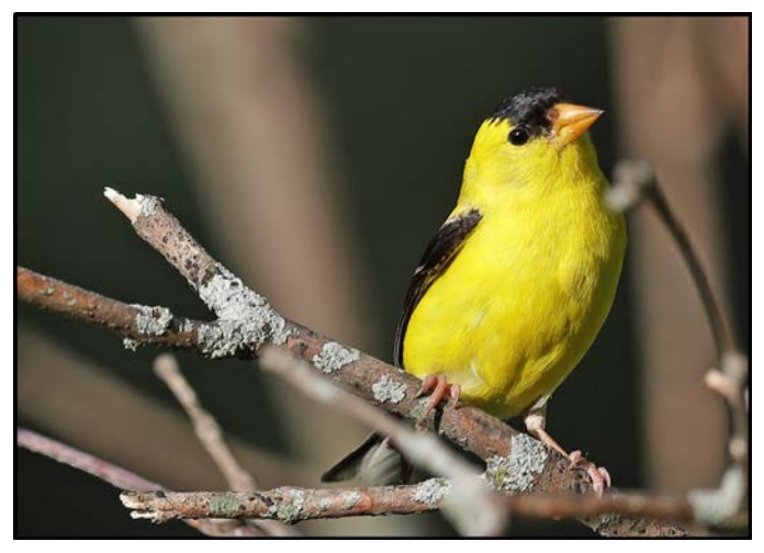
Figure 2. Although currently found at the Parkway, suitable climate for the American Goldfinch ( Spinus tristis ) may cease to occur here in summer by 2050, potentially resulting in local seasonal extirpation.

Parkway may serve as an important refuge for 15 of these climate-sensitive species, 8 might be extirpated from the Parkway in at least one season by 2050.