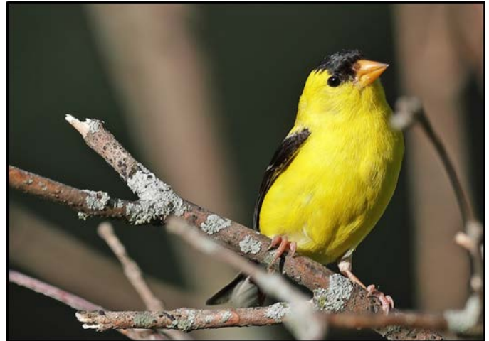
Figure 2. Although currently found at the Site, suitable climate for the American Goldfinch ( Spinus tristis ) may cease to occur here in summer by 2050, potentially resulting in local seasonal extirpation.

Site may serve as an important refuge for 8 of these climate-sensitive species, 4 might be extirpated from the Site in at least one season by 2050.