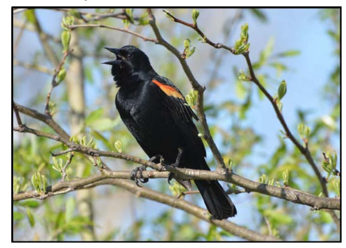
Figure 2. Climate at the Site in summer is projected to remain suitable for the Red-winged Blackbird ( Agelaius phoeniceus ) through 2050.

climate-sensitive species, one, the Western Wood-Pewee ( Contopus sordidulus ), might be extirpated from the Site in summer by 2050.