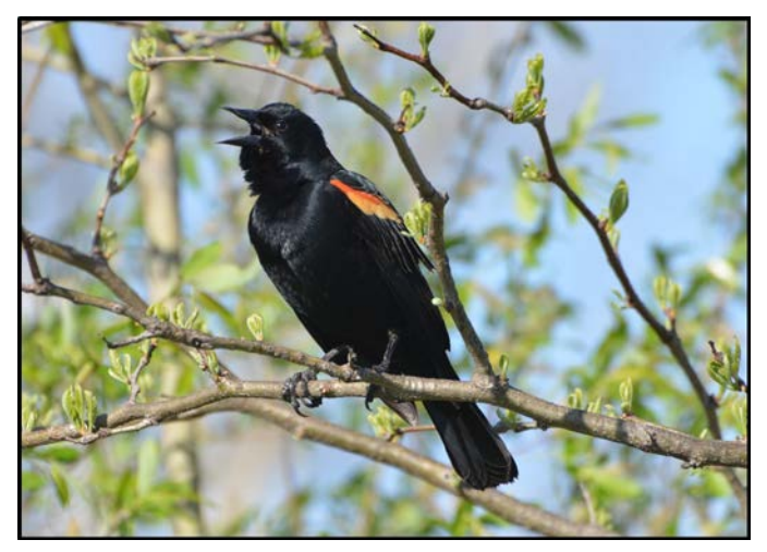
Figure 2. Although currently found at the Monument, suitable climate for the Red-winged Blackbird ( Agelaius phoeniceus ) may cease to occur here in summer by 2050, potentially resulting in local seasonal extirpation.

While the Monument may serve as an important refuge for 3 of these climate-sensitive species, 2 might be extirpated from the Monument in at least one season by 2050.