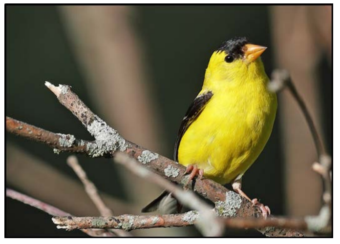
Figure 2. Climate at the Lakeshore in summer is projected to remain suitable for the American Goldfinch ( Spinus tristis ) through 2050.

and/or winter by 2050; Table 1; Langham et al. 2015). While the Lakeshore may serve as an important refuge for 5 of these climate-sensitive species, 7 might be extirpated from the Lakeshore in at least one season by 2050.