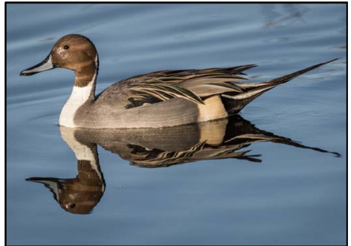
Figure 2. Although currently found at the River, suitable climate for the Northern Pintail ( Anas acuta ) may cease to occur here in summer by 2050, potentially resulting in local seasonal extirpation.

climate is not projected to disappear for these 11 species at the River; instead the River may serve as an important refuge for these climate-sensitive species.