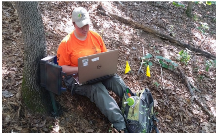
Data from soil moisture monitors was collected periodically throughout the summer for continuous monitoring. Monitors were installed on four sites that represented low and high elevations, as well as northern and southern aspects.