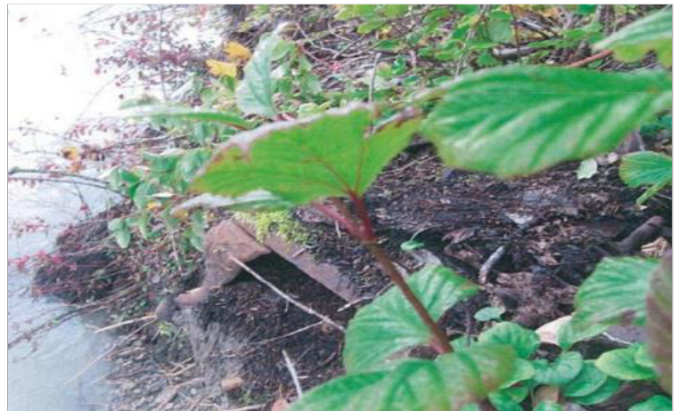
A gold rush era stove being washed into the Taiya River. This entire archaeological site will be swept away in the next 8 years if current erosion rates continue.