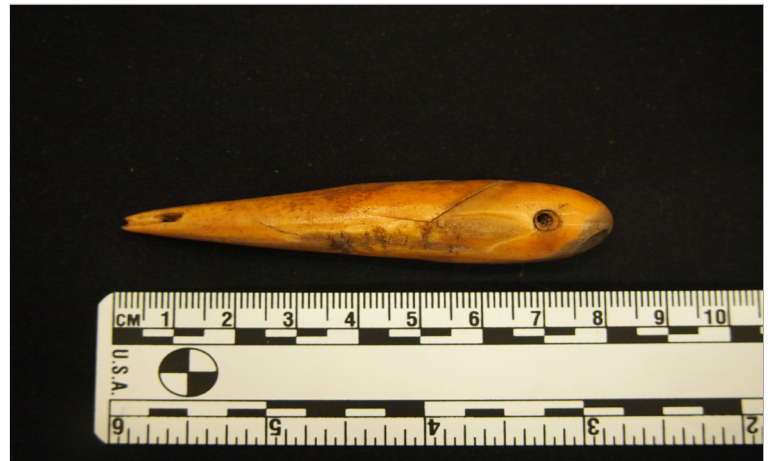
An ivory fish lure from Bering Land Bridge National Park.