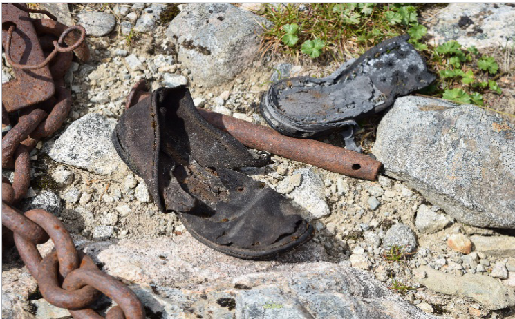
Organic artifacts like these gold rush era leather shoes have been well preserved along the Chilkoot Trail Unit. Melting ice patches and early snow melt are negatively altering the preservation environment, making these artifacts vulnerable to more rapid decomposition.

Each resource is impacted by different threats in different ways, thus there is no single response strategy for climate change threats to archaeological resources at KLGO. The takeaway message from the project is that the impacts of climate change on cultural resources can vary greatly within a land management area, so managers must determine cultural resource prioritization and develop resource specific response strategies.