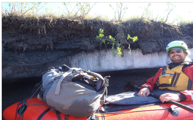
Exposed permafrost along the John River.