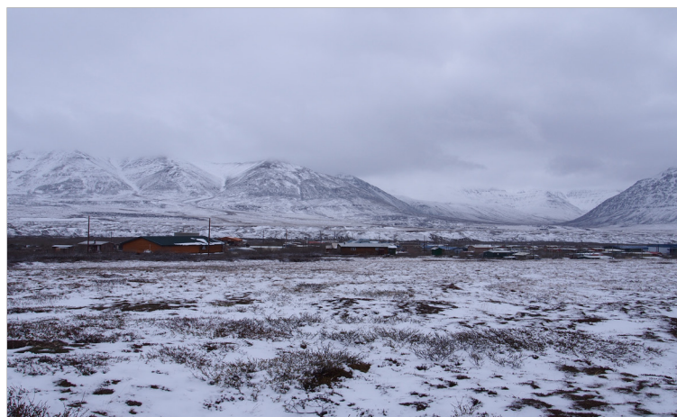
Anaktuvuk Pass surrounded by a snowy June landscape. NPS Image

– Jeff Rasic, Gates of the Arctic National Park and Preserve