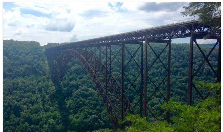
The forest surrounding New River Gorge bridge, once almost completely logged, is now part of one of the largest carbon sinks in the US.