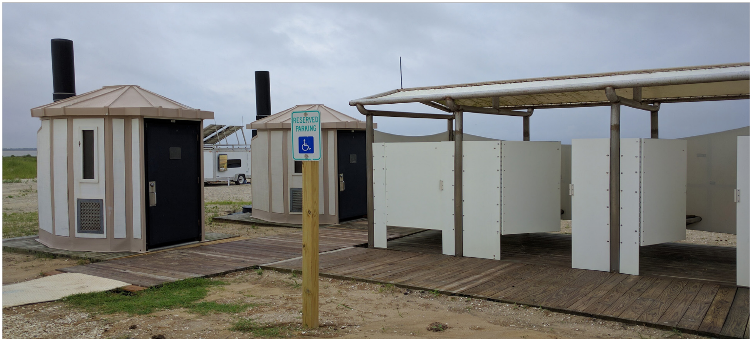
The utilization of moveable infrastructure along the beach helps manage risk and protect investments at Assateague Island National Seashore.

In addition, a summary document of lessons learned and best management practices supplements NPS #13375A4. This summary document provides park planning leads with a well-rounded picture of adaptation efforts which includes; challenges faced; lessons learned; and best management practices; currently underway across the service. The complexity of planning for a changing climate—coupled with the wide array of ongoing issues that must also be addressed—makes adaptation no easy feat. The compiled challenges, opportunities, and successes from across the NPS, supports park planners in more fully understanding available options for future resilience efforts.