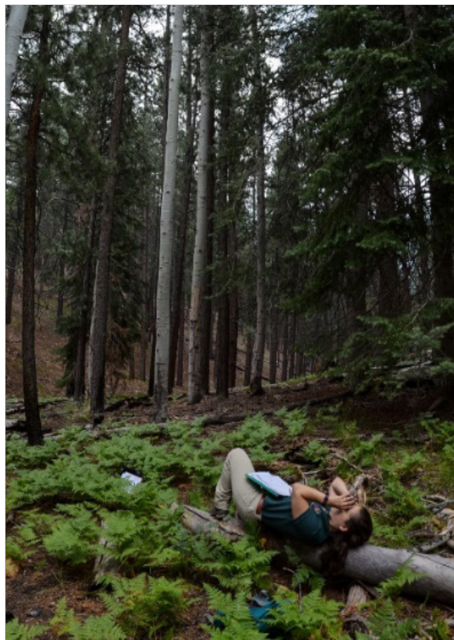
Phenology data was collected on the Quaking Aspens twice per week at the North Rim. NPS Image