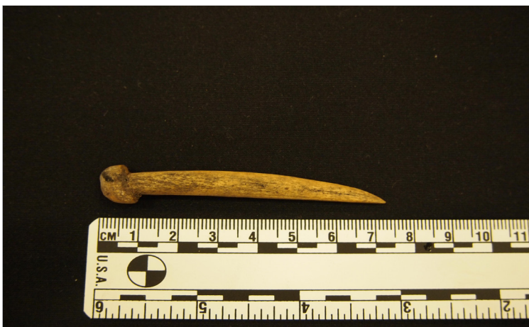
An antler leister barb from Noatak National Preserve.