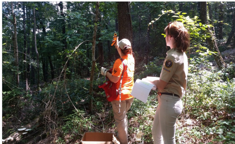
Fowler takes weather conditions that will be used later for analyses of fuel and duff moisture responses to environmental conditions.

“Leslie and I had a great mentoring relationship, with open communication and persistence in working together.” – Shelley Todd, Hot Springs National Park