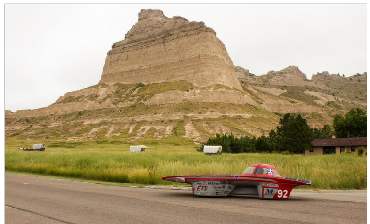
A solar car travels past Scotts Bluff National Monument during the American Solar Challenge. NPS Image