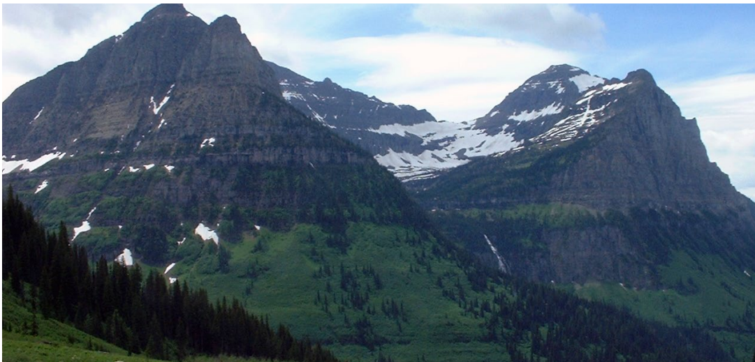
Photos of Acadia, St. Croix, Yosemite, and Glacier