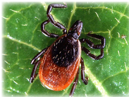
Adult deer tick; photo courtesy CDC.

Information about the NPS Office of Public Health can be found at: http://www.nps.gov/public_health/index.htm