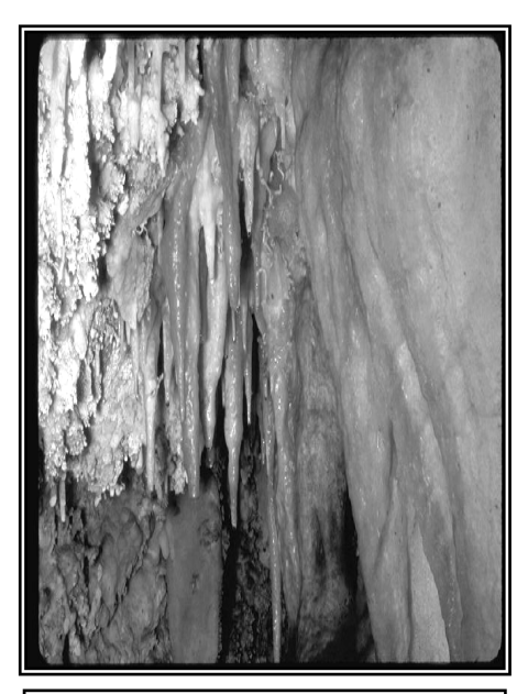
Stalactites from Timpanogos Cave National Monument, Utah.

1. The caves of our national parks house some extraordinary formations. How do you think water contributed to the formation of these real cave formations?