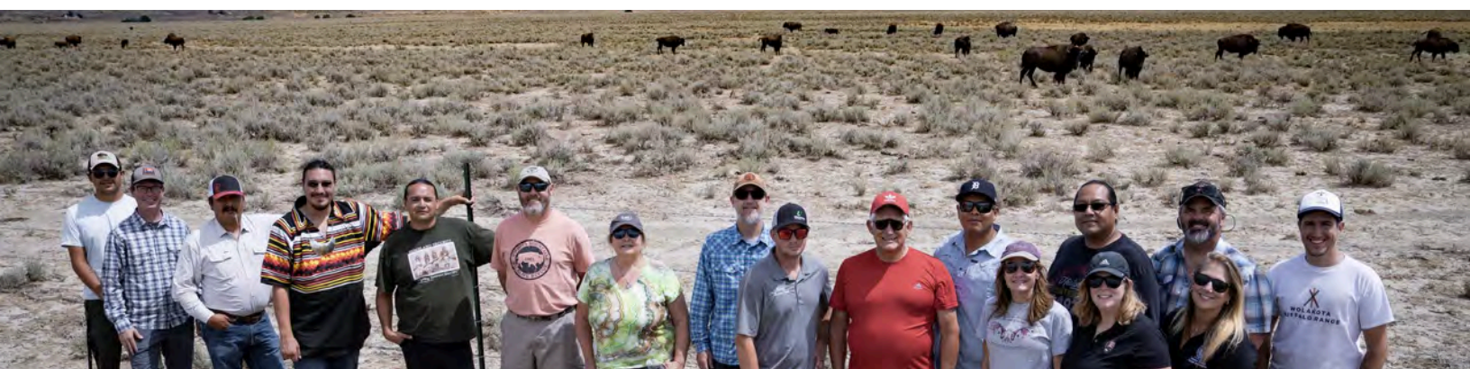
Bison shared stewardship coauthors and team on the Wind River Reservation

When you, our reader and our current or future partner, consider how you yourself can utilize this Strategy to promote ecocultural restoration of bison, please follow the buffalo's voice, and follow your hearts.