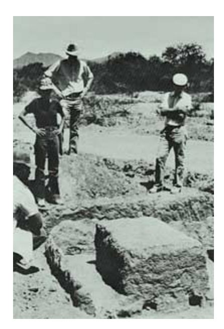
Figure 2. Archeologists sharing information at site of Hohokam village during the CAP peer review, 1986.