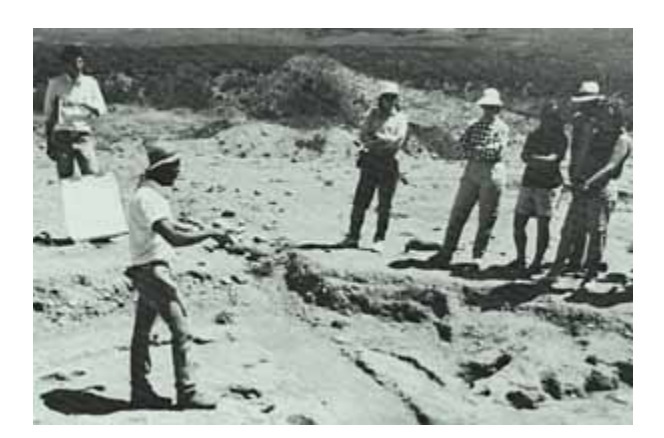
Figure 1. Archeologists explaining excavation of a Hohokam pioneer period pithouse, CAP peer review, 1986.

Because such evaluations improve the agency proposal, stipulations for formal peer reviews are often specifically included in memoranda of agreement or agency contracts. In the case of data recovery projects designed to mitigate the loss of important information, such evaluation is done by the agency before a project is announced for bidding. As part of the proposal, the winning bidder also prepares a research design or work plan which provides refinements for conducting