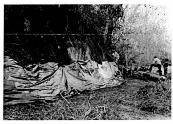
Figure 2. Installation of underliner

underliner would be to protect the portion of the fabric that would be submerged by the lake water. It was considered possible that the submerged fill material in the mound would be melted during the period of submersion and the silt sized particles would then be trapped in the pores of the fabric. Filling of the pores would not only retard the passage of rainwater during low water periods, but the accumulated soil would add weight to the fabric. This added weight would then in turn put additional stress on the pins that hold the fabric in place. To prevent this situation from developing, an underliner of black polyethylene (6 mils) was installed along the face of the mound to a height of 4 ft, well above the high water line on the face of the mound.