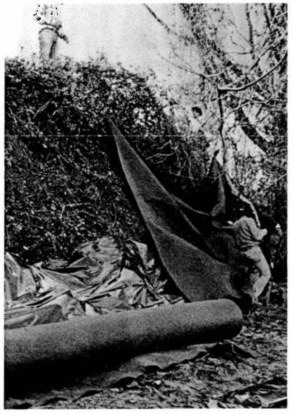
Figure 3. Installing filter fabric

The final step in the stabilization process was the preparation of a report describing the activity that has been undertaken (Thorne 1987).