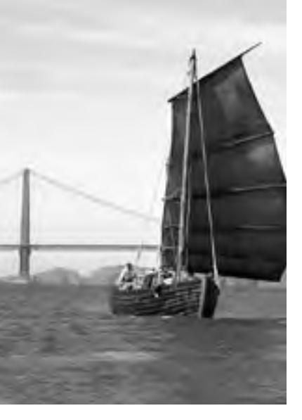
■ The Grace Quan sails San Francisco Bay in one of its last sea trials prior to the official maiden voyage in April 2004. The ship helps the San Francisco Maritime National Historic Park staff interpret shrimp trawling and the lifeways of Chinese fishermen on the bay.