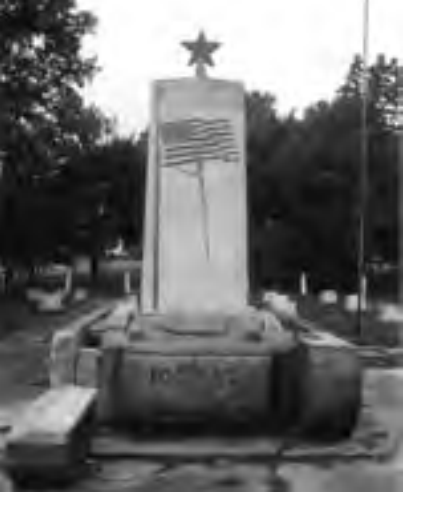
■ The Rohwer Veterans Memorial in Arkansas is a testament to the valor of the men of the 100th Battalion, 442nd Regimental Combat team. This all-Japanese American unit, filled with volunteers from relocation camps, was the most highly decorated unit of its size during World War II.