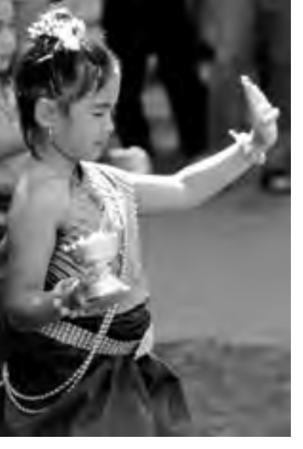
■ The Angkor Dance Troupe serves as a keeper of Cambodian culture for Khmer youth growing up in the United States. They learn traditional dances and wear traditional clothes, as the younger members of the troupe did at the Lowell Folk Festival in July 2001.