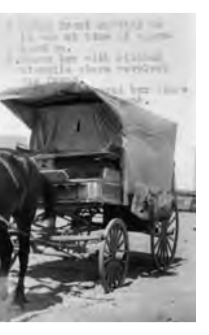
■ Prohibitions on immigration forced Chinese and other Asians to resort to smuggling themselves across the Mexican border into the U.S. This ca. 1921 photograph of a smuggling buggy was used as evidence in a federal case against individuals illegally assisting Chinese migrants.