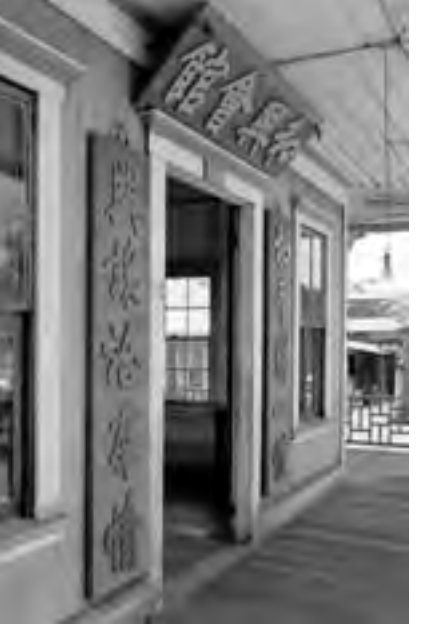
■ The Chee Kong Tong House, pictured in 1966, was a meeting place for Chinese from the same district living in Maui.