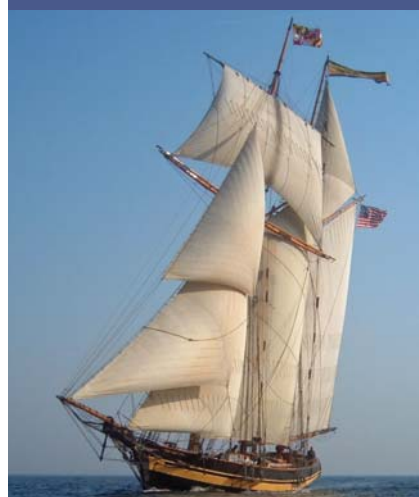
Pride of Baltimore II (Pride of Baltimore, Inc.)

National Park Service 410 Severn Avenue, Suite 314 Annapolis, MD 21403 410-267-5700 STSP_Information@nps.gov www.nps.gov/stsp