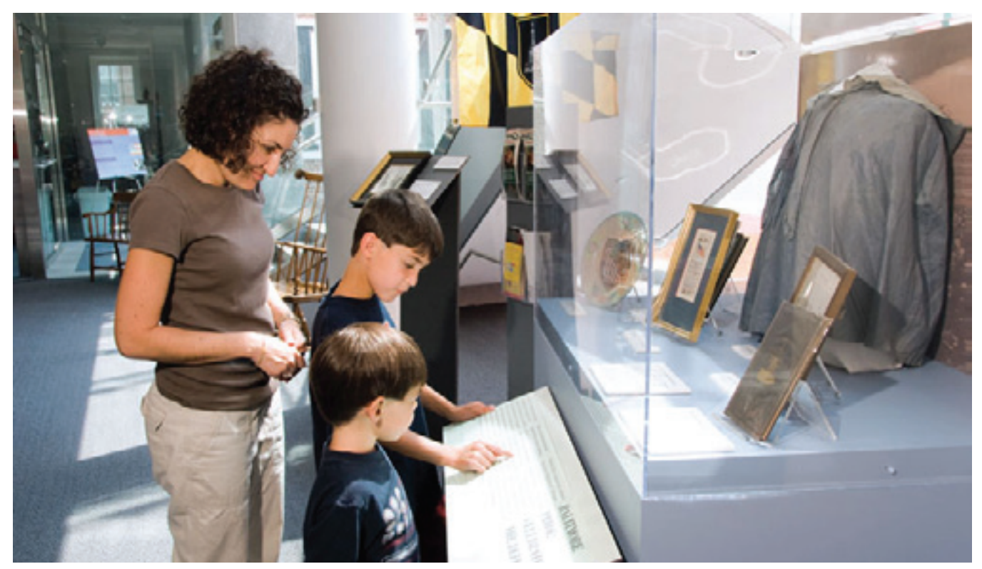
Family viewing exhibit: Learning about the Battle of Baltimore at the Star-Spangled Banner Flag House and Museum