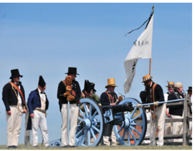
Defender's Weekend at Fort McHenry National Monument and Historic Shrine

In 1812, the United States of America was less than 30 years old, and only one generation had been raised to adulthood under the American flag. Many people still personally remembered the daring and exhausting fight to win independence from Britain, pitting 13 allied colonies against the largest military force in the world. The conflict had launched a new nation, but in 1812 much was still taking shape.