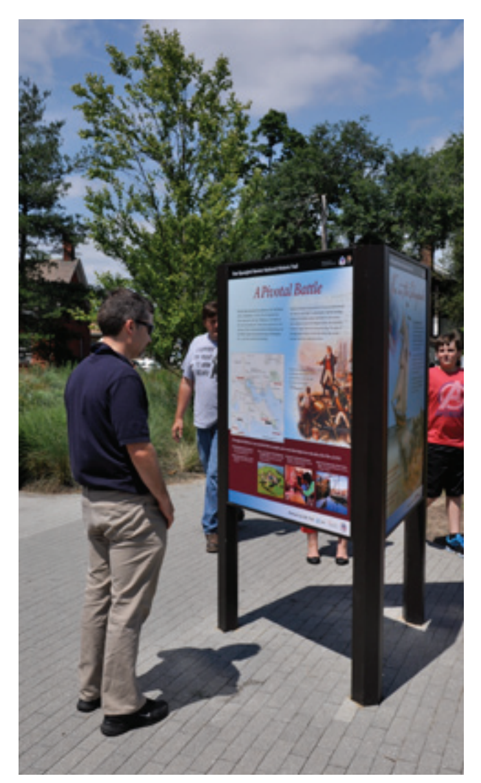
Orientation kiosk at Fort McHenry National Monument and Historic Shrine

The trail will therefore provide a range of opportunities for different ages, interests, and abilities across a network of partner sites strongly linked by public routes and recreation