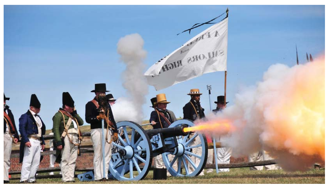
Fort McHenry National Monument and Historic Shrine (Dietrich Ruehlman)

The plan also identifies property acquisition, construction and other improvements needed to create and enhance the visitor experience along water portions of the Trail. Assessment criteria will include historic integrity and site significance, interpretive and visitor experience potential, anticipated visitation, ease of access, proximity and connectivity to other sites, development feasibility, investment needed to improve the site, and stewardship needs and opportunities. The plan will serve as a framework for water trail investments over the next five years.