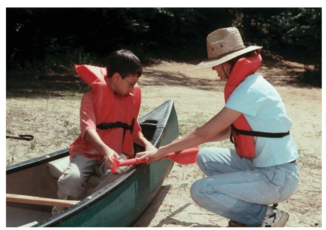
Canoeing Lesson, Sotterley Plantation, Hollywood, MD