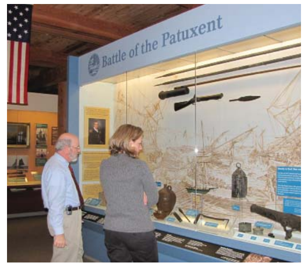
Calvert Marine Museum, Solomons, MD