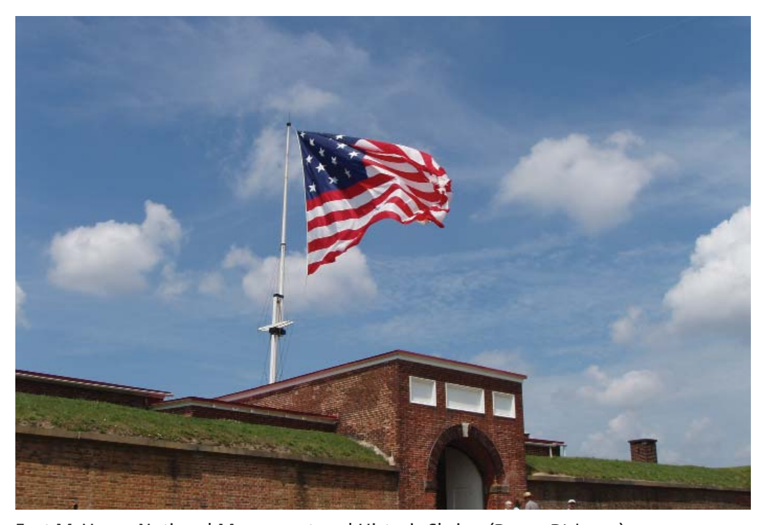
Fort McHenry National Monument and Historic Shrine (Donna Dicksson)

Examining the economic and political significance of the Chesapeake region is an important complement to exploring the military events of the Chesapeake Campaign. Prior to the British blockades of 1813, the Chesapeake Bay played