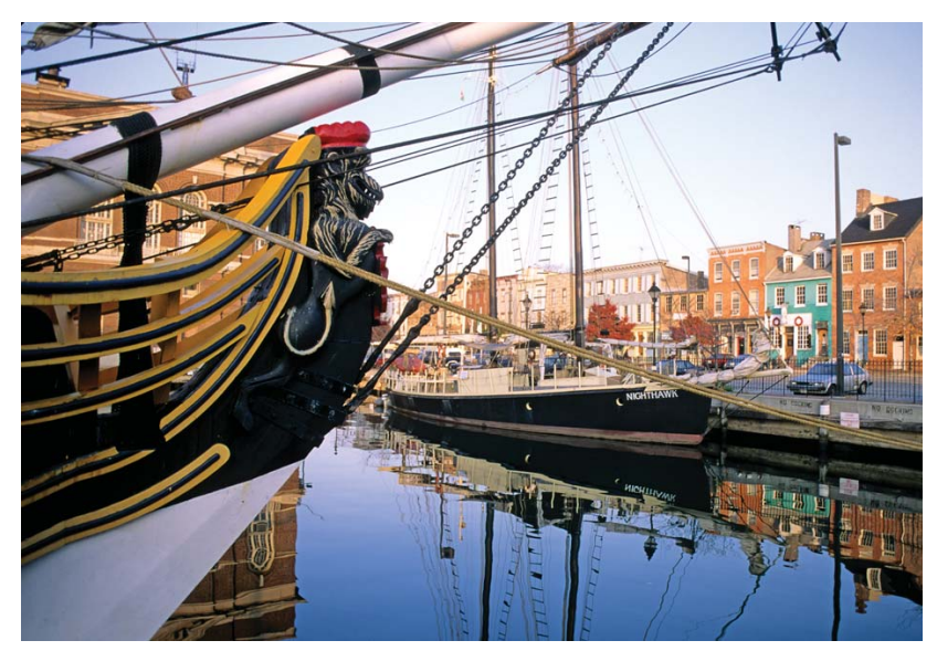
Fell's Point, Baltimore, MD