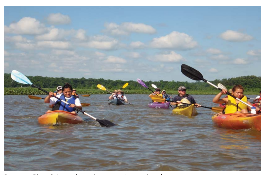
Patuxent River Sojourn

The father engages a volunteer interpreter in a discussion of the arms used by 19th century soldiers, sailors and marines comparing them to weaponry and technology soldiers use today. The father wants to learn more about the battles of the War of 1812. He begins to plan future visits to nearby Fort McHenry, the Battle of Bladensburg Visitor Center south of Baltimore and Havre de Grace, north of the Heritage and Historic Trail Center.