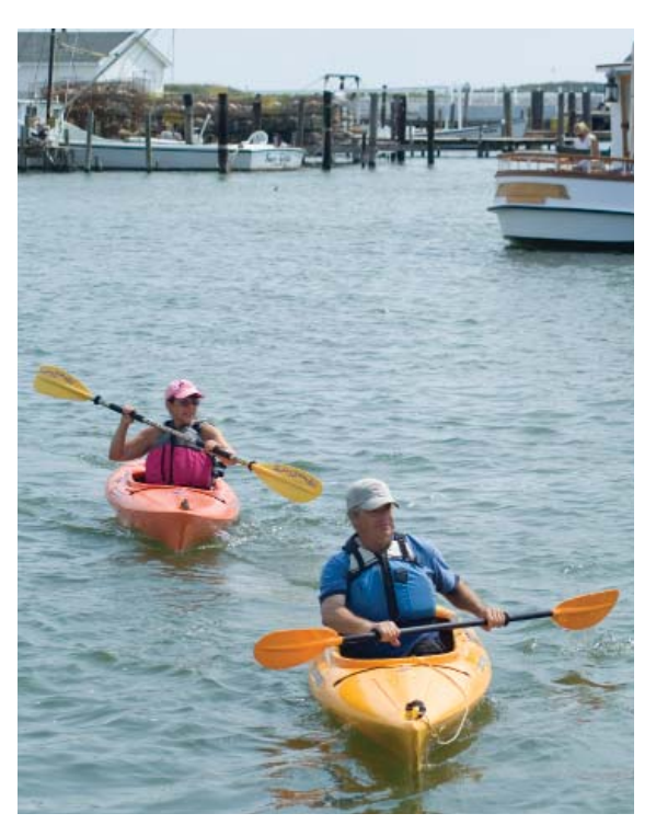
Kayakers off Tangier Island, VA

Significantly, until the 1968 law, the only federal role in trails was to build and maintain trails on federal lands. The 1968 Act provided for federal recognition and promotion of trails, including portions not on federal land, by providing financial assistance, supporting volunteer activities and coordinating with states and other authorities.