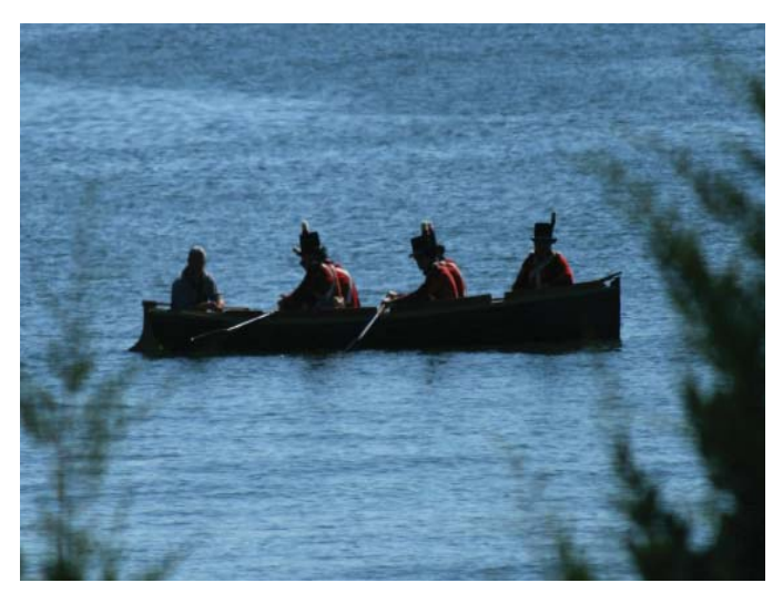
War of 1812 Reenactment, Jefferson Patterson Park and Museum

the size of Britain's and was widely scattered. However, Americans were emboldened by the fact that the British were also embroiled in the Napoleonic Wars, spanning from 1803 to 1815 in Europe. The United State's Declaration of War made it necessary for British troops, supplies and funds to be diverted from that conflict with the French to defend their interests in Canada. Britain saw America as an important market and