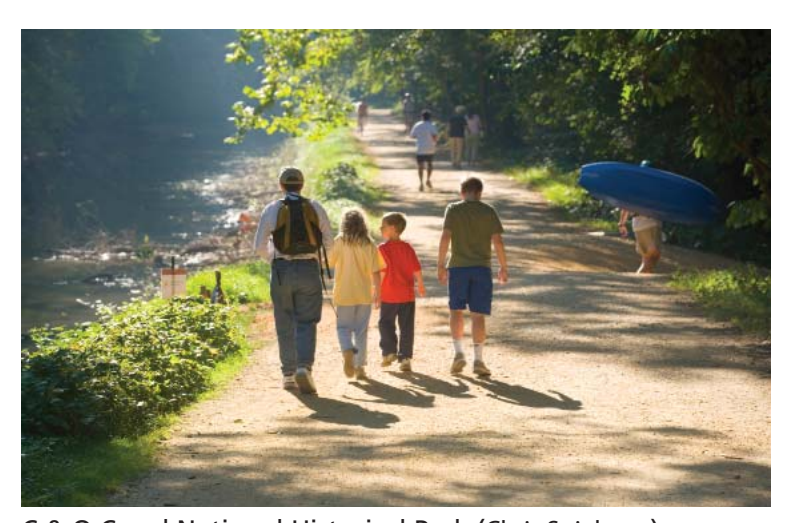
C & O Canal National Historical Park

The following draft purpose and significance statements aid in the development of the Trail's comprehensive management plan, and inform the Trail's primary interpretive themes. These purpose and significance statements and the primary themes will be further refined during the comprehensive management planning process.