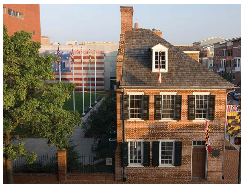
Flag House and Star-Spangled Banner Museum, Baltimore, MD

Importantly, the study found that cultural and heritage travelers spend an average of $994 per trip compared to $611 for all U.S. travelers.