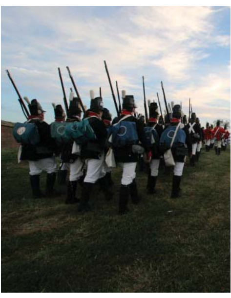
Soldiers in Formation, Fort McHenry National Monument and Shrine