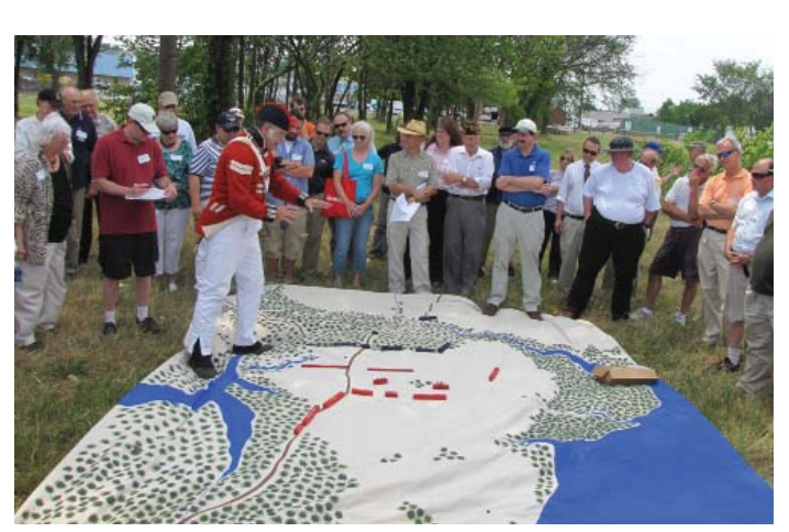
Maryland War of 1812 Bicentennial Commission, Star-Spangled 200 Baltimore County Tour, North Point, 2010

Interpretation is telling a story. It is a communication process designed to reveal underlying meanings to visitors through immersive, first-hand involvement with objects, features, landscapes or authentic places. Interpretation helps people to