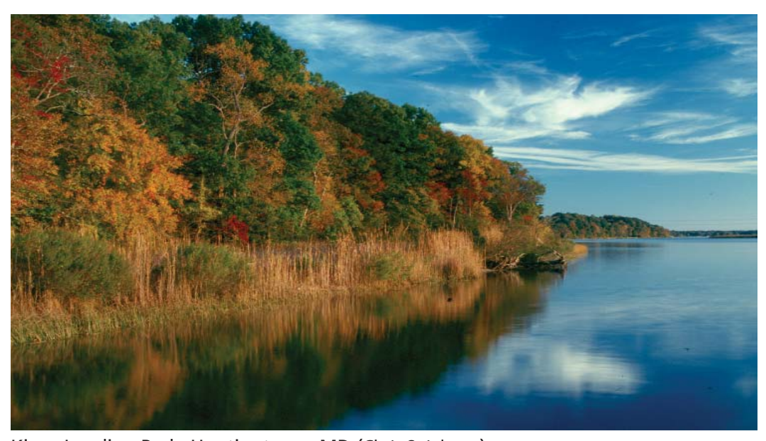
Kings Landing Park, Huntingtown, MD

Each partner's active involvement in implementing the ideas presented in this interpretive plan is vital to the success of the Trail's overall interpretive effort. The process of developing the Trail's interpretive program will be enriched as partners apply their experience and perspectives, local knowledge and specific opportunities associated with their individual sites or regions.