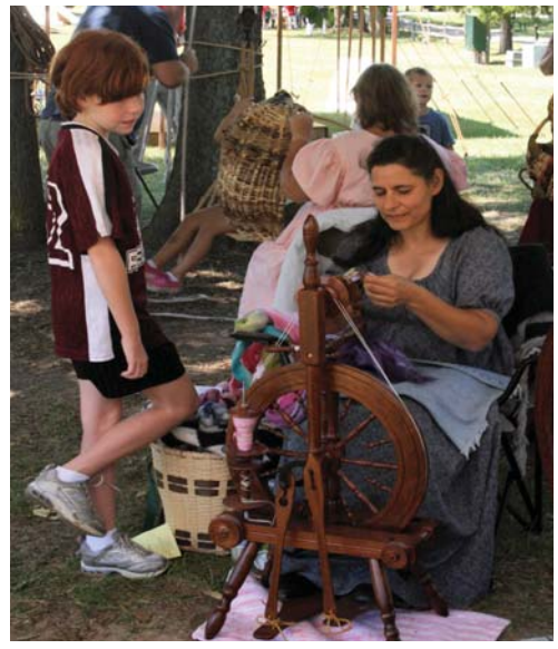
Jefferson-Patterson Park and Museum

well-crafted, unforgettable experiences knowing that even within the same family or group of friends, a canoeing adventure may appeal to some, while touring an historic home will inspire others. The Trail must effectively serve multiple audiences that have varied needs and interests.