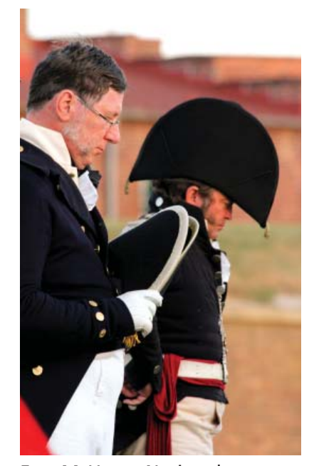
Fort McHenry National Monument and Historic Shrine

"The Chesapeake Campaign of 1814 is significant in and of itself and represents key turning points in American social and political history. The events of the invasion contributed to the preservation of a young nation and its Constitution."