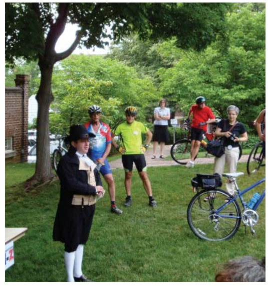
National Trails Day Bicycle Ride, Carlyle House, Alexandria, VA

The Commission is coordinating research, programming and activities throughout the state. A bicentennial kick-off event will be held at Montpelier in 2011. A War of 1812 symposium is planned for June 2014 at Fort Monroe featuring family-friendly events, educational seminars and re-enactments. Ongoing efforts in Virginia include securing 15 new historical markers with War of 1812 interpretation to complement 40 existing markers. For details, visit http://dls.state. va.us/1812.htm.