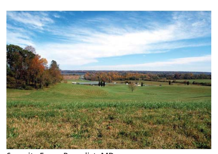
Serenity Farm, Benedict, MD

This national historic trail offers parks, historic sites, heritage areas, tourism bureaus, educators, conservation organizations, communities and private