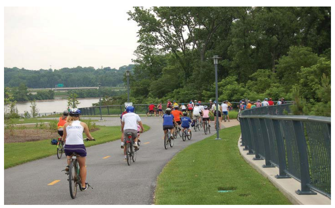
National Trails Day Bicycle Ride 2010