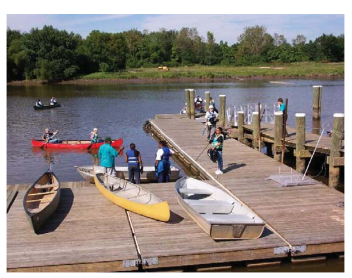
Bladensburg Waterfront Park, Bladensburg, MD

Within this diverse population of potential visitors, several distinct audiences for the Trail can be identified based on historical tourism patterns and projections, demographic trends, and the unique cultural and historical resources of the Trail.