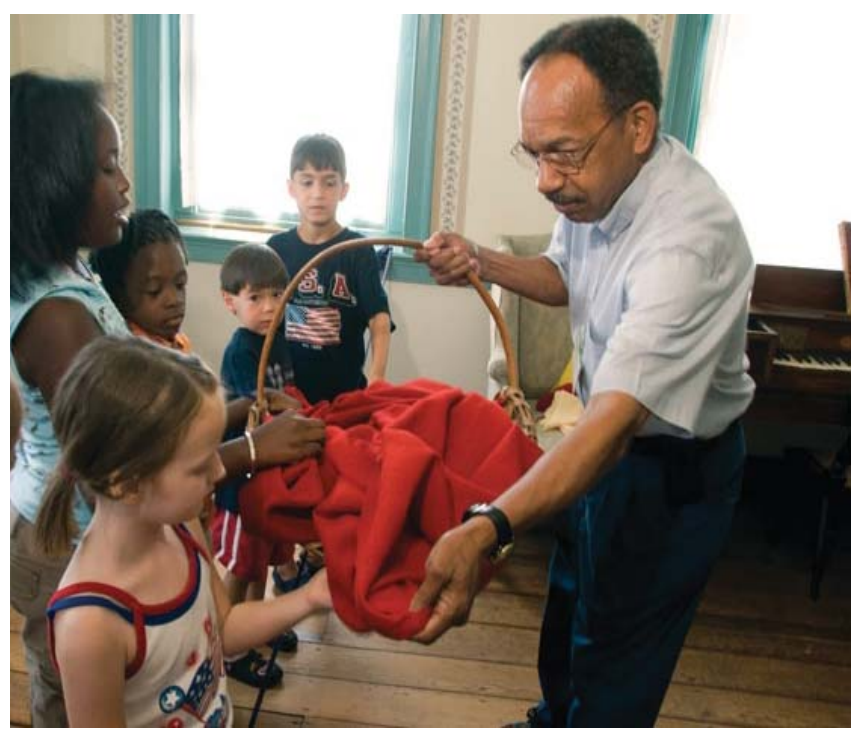
School Program, Flag House and Star-Spangled Banner Museum, Baltimore, MD

Many National Park Service units report that school groups represent more than 80% of their visitors on weekdays in mid-fall and mid-spring. At Fort McHenry National Monument and Historic Shrine, approximately 15% of its 570,000 visitors in fiscal year 2009 were school groups.