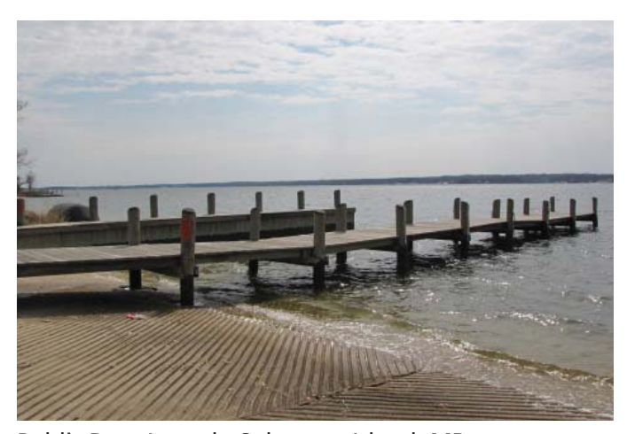
Public Boat Launch, Solomons Island, MD

1.5 million people gathered in Baltimore for OpSail 2000, a similar event. Media attention generated by these large scale maritime festivals will raise awareness nationally of the War of 1812 bicentennial. The Navy has earmarked funding for educational initiatives related to naval involvement in the War of 1812.