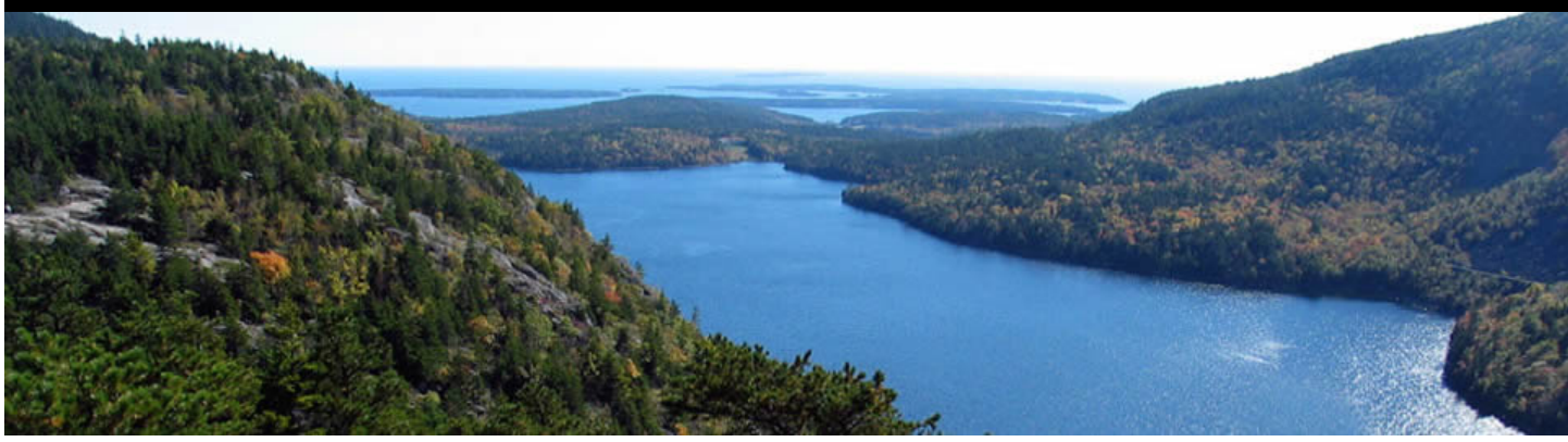
Acadia National Park