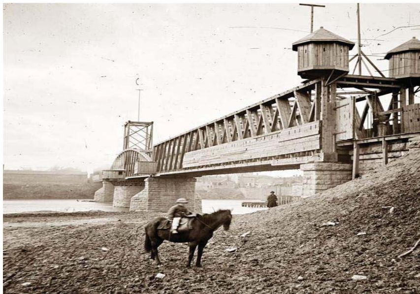
Blockhouses protecting the railroad over the Cumberland River at Nashville, Tennessee

The effective use and control of the railroads would ultimately win the war for the Union while the Confederate rail system would be left in chaos by war's end. Future wars would see an increased use of railroads to mobilize troops, move supplies, and employ many of the same strategies to provide victory by rail.