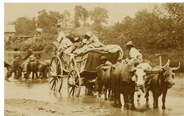
Contraband slaves fleeing Confederate forces in Virginia.

them, and placed them in charge of security at the newly organized contraband camp for the refugees on the northeast side of Corinth.