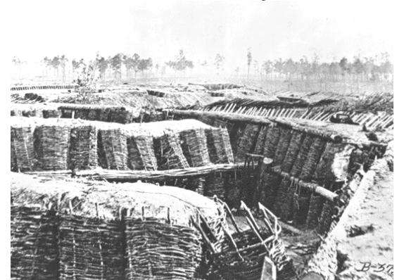
Use of gabions and fascines

battles, and occupation of Corinth. Yet, with just a little imagination, one can envision how things would have appeared to those soldiers building, manning, and fighting in these works during the Civil War.