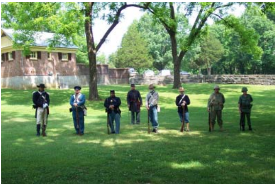
Honor Guard representing America’s wars

as today, have often been spotlighted for their services. On Memorial Day in 1907, sixty-five aged members of the 21 st Missouri returned to the battlefield and were honored guests. And just as today, orators ranging from governors to judges to former generals have spoken eloquently about the need to remember the sacrifice of our nation’s war dead.