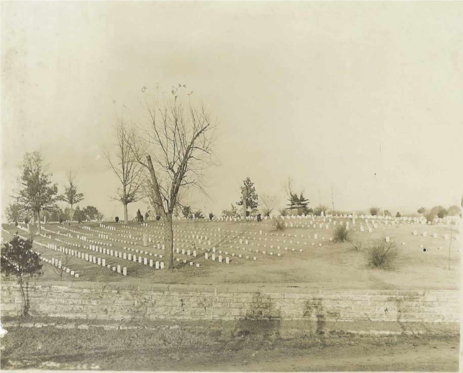
Shiloh National Cemetery