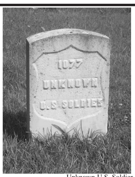
Unknown U.S. Soldier

National cemeteries and soldier plots are special places, and Shiloh is no different. Buried with these American soldiers is the honor, courage, and sacrifice of an entire American generation. Indeed, these soldiers gave the ultimate sacrifice for what they believed in. Can we of today's generation learn from these soldiers and meet our own challenges and problems with the same dedication they possessed? Despite different means to wage war, different enemies to face, and different objectives to win, we are still fighting for the same causes they were: life, liberty, and the pursuit of happiness. Perhaps President Lincoln said it best when he declared "that these dead shall not have died in vain," but that this nation "shall not perish from the earth." It is our duty to take the standard and make sure Lincoln's vision is never lost.