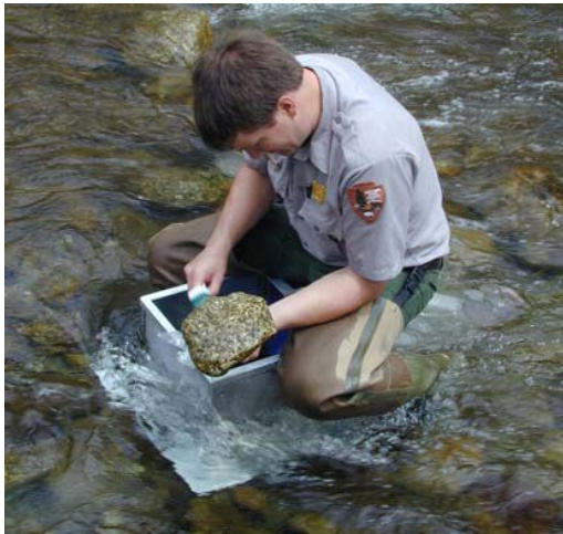
Park employee using a Portable Invertebrate Box Sampler (PIBS) on the Staunton River, April 2003.

Aquatic insects are numerous, have short life cycles, and are directly affected by changes in water chemistry and flow. These factors coupled with relative ease of sampling, makes them excellent indicators of aquatic ecosystem health. There is also more species diversity in the insect community than more highly visible organisms such as fish. A change in species composition is relatively easy to detect and can then be used to assess stream decline or recovery.