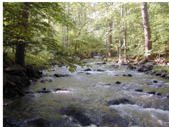
Happy Creek in Warren County sampled May 2004.

There are six major geologic types which compose 18 variations of rock strata in the drainages sampled to date. The only streams that stand out as having a different aquatic macroinvertebrate community structure are in the siliciclastic formations. Streams that flow over siliciclastic bedrock are considered low ANC streams. There is no clear break in aquatic invertebrate communities within the granitic or basaltic geologic types. Analysis is continuing on a stream by stream basis and may show differences in flood and drought effects as more data is analyzed.