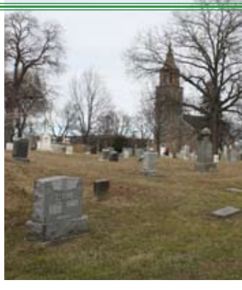
Stewardship is the careful and responsible management of something entrusted to a person or community's care.

What are some things YOU can do to help care for our National Parks?