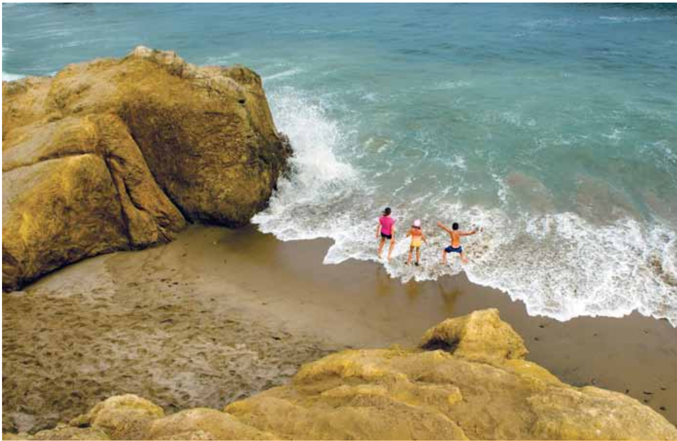
Small coves await discovery.