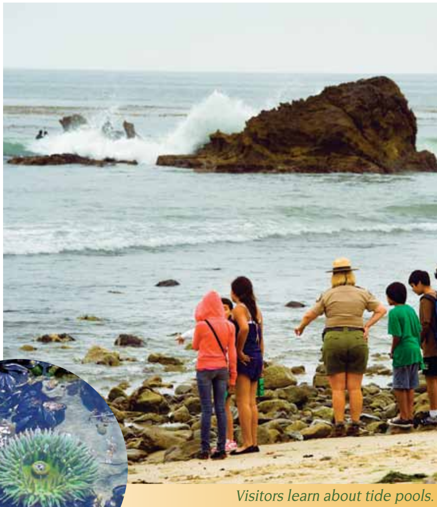
Visitors learn about tide pools.

In April and May, gray whales may be seen from the beach as mothers (cows) and babies (calves) return north. Dolphins, harbor seals and sea lions can also be seen swimming along the beach.