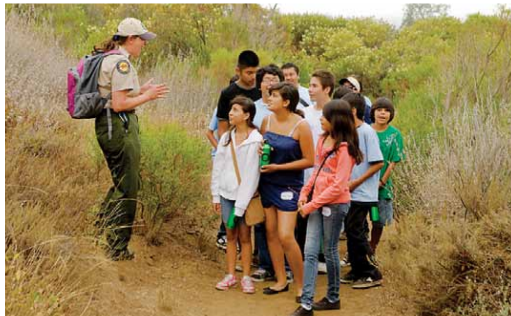
An interpretive walk through coastal sage scrub habitat

The Mediterranean climate and varied topography support chaparral, coastal sage scrub, riparian woodland, wildflowers and coastal strand plant communities. Higher inland regions support dense brush, fire-adapted chaparral species such as chamise, manzanita, ceanothus and scrub oak. Lower elevations are home to the sage scrub plant community—prickly pear cactus, buckwheat, giant coreopsis, California sagebrush and bush sunflower. Riparian plant communities—California bay, willow, black