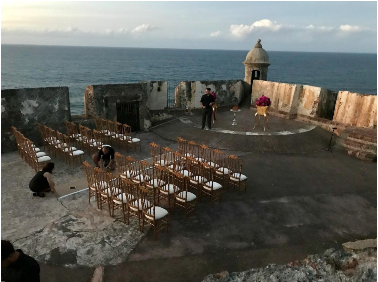
People in preparation of a wedding ceremony at Bateria Del Carmen with chairs, flower decoration and a carpet.