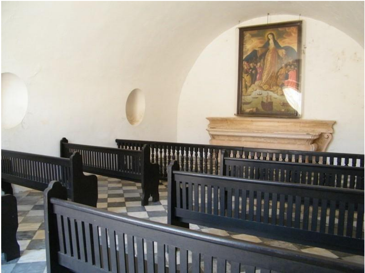
The Virgin of the Navigators Chapel.