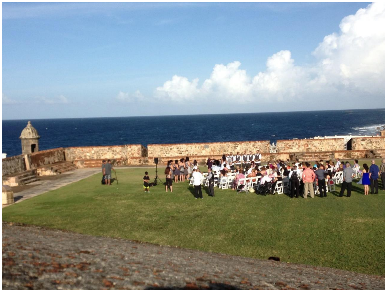
People waiting of a wedding ceremony at Santa Rosa Bastion with chairs and battery charge audio system .