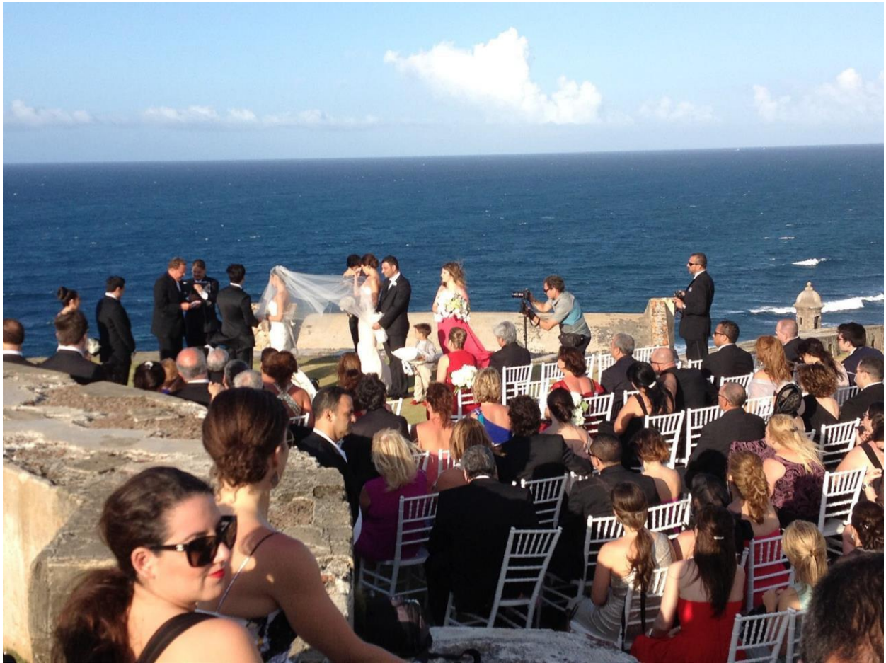
Wedding ceremony at San Antonio overlook with chairs.