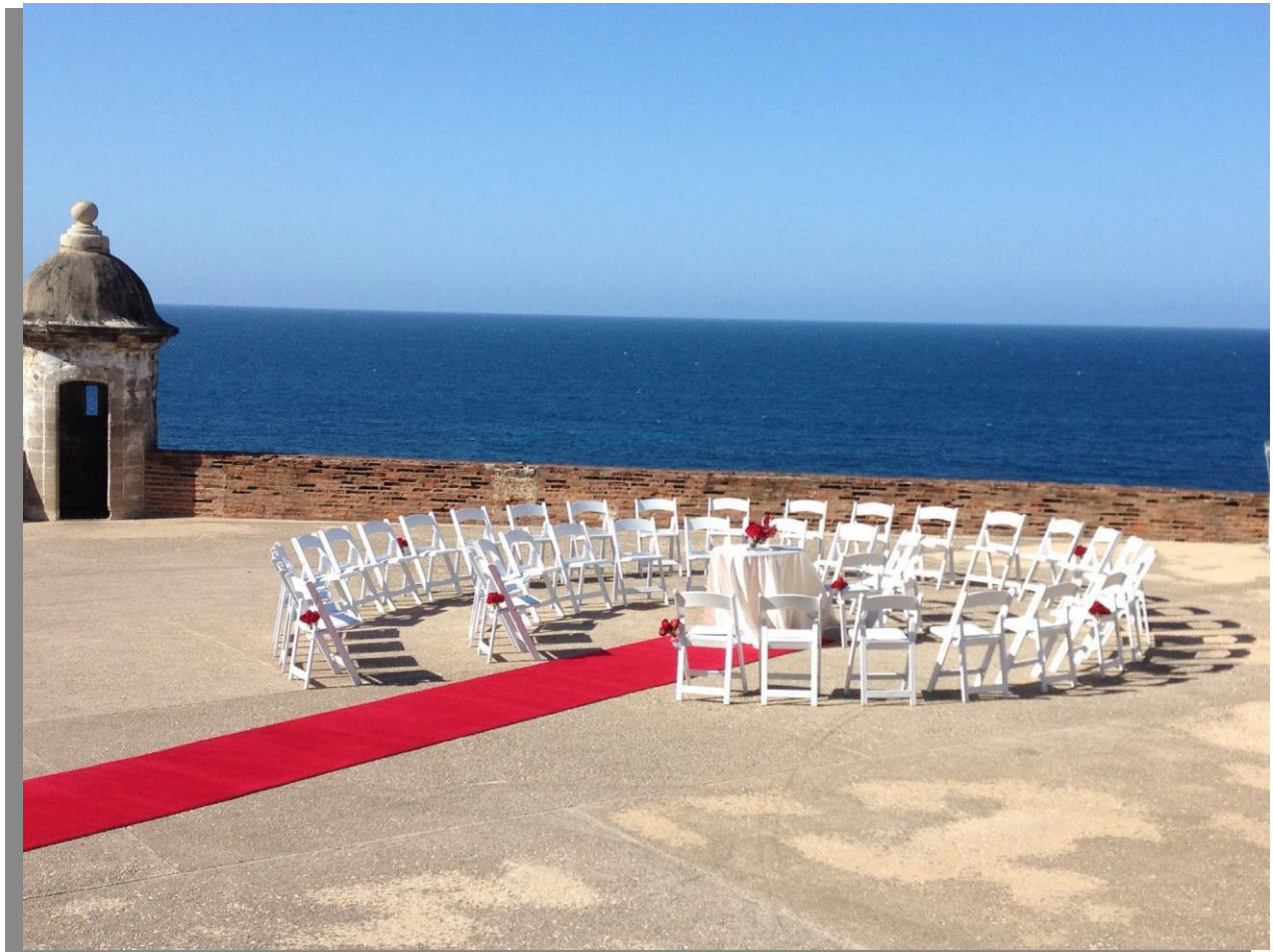
View of Plaza Norzagaray, the Garita, the ocean and chairs in preparation of a wedding ceremony.