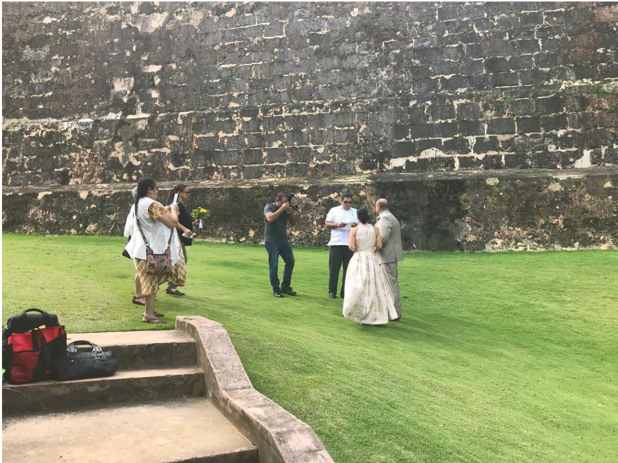
Couple getting marry at San Felipe del Morro dry moat.