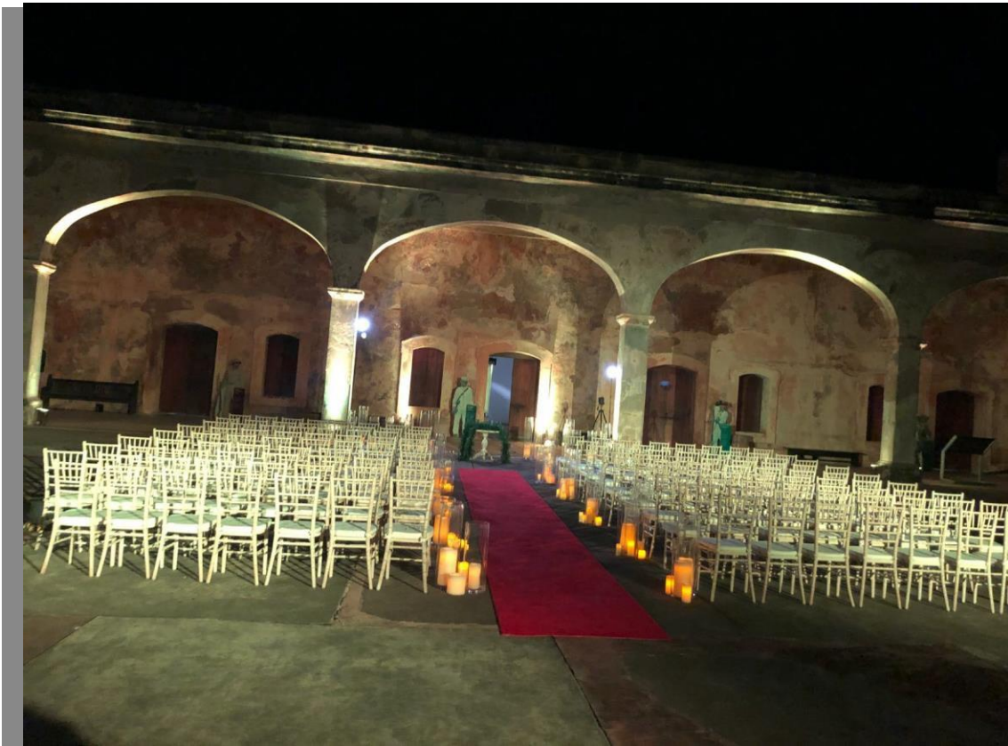
Plaza Principal of San Cristobal during the night with chairs, LED's candle lights and light to illuminate the area.