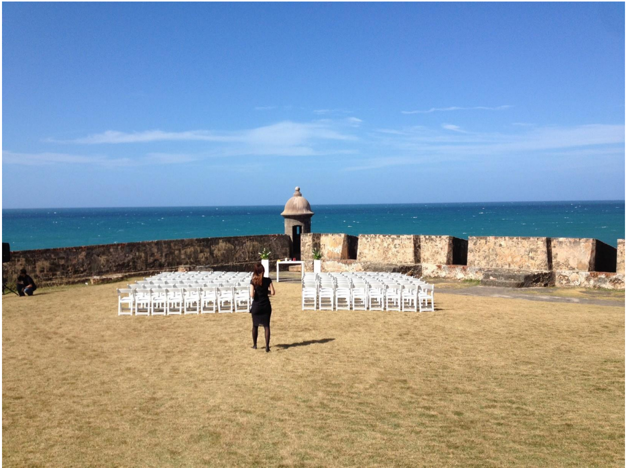
Wedding ceremony at San Sebastian Bastion with chairs and flowers decoration.