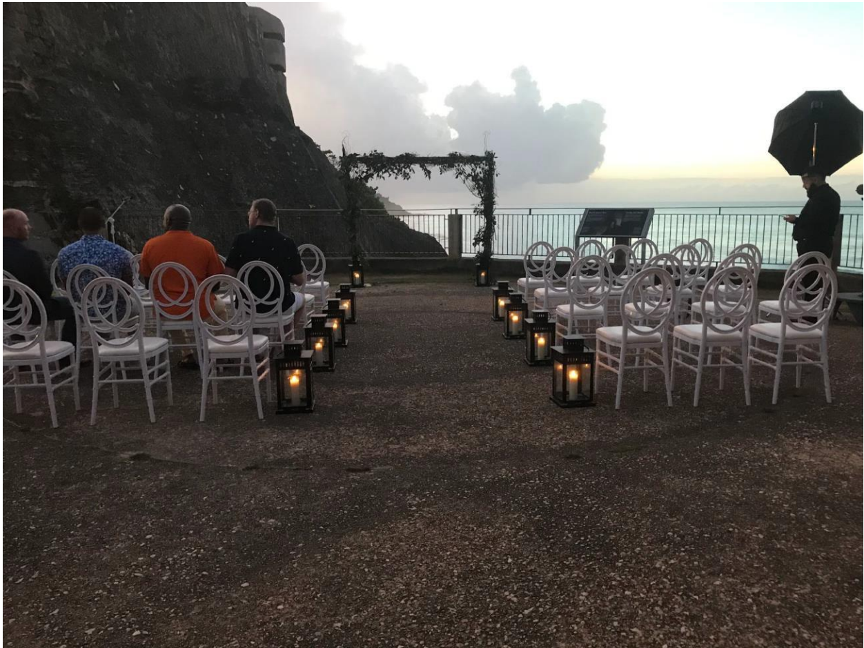
People waiting of a wedding ceremony at Santa Teresa overlook with chairs, LED's candle lights and arch.