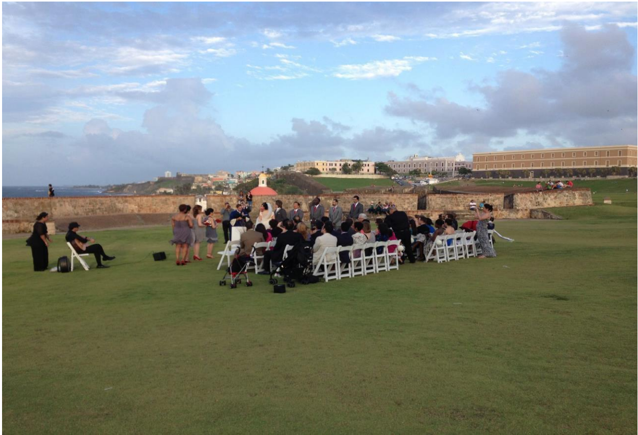
Wedding ceremony at San Antonio Bastion with chairs and musicians. For your safety and the preservation of the historical wall please stay off from the Walls.