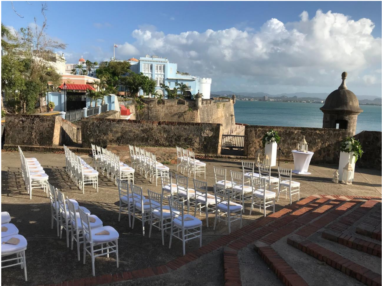
Wedding ceremony preparations at La Rogativa with chairs, flower decorations and decoration.