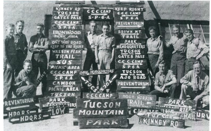
Photograph of men from Camp Pima with roadway signs that were to be used along the roads in TMP. Note adobe building in the background. This building is probably Feature 6, the garage and shop building.

These signs were typical of the NPS Rustic architecture from that period. In fact, two of the parks signs which