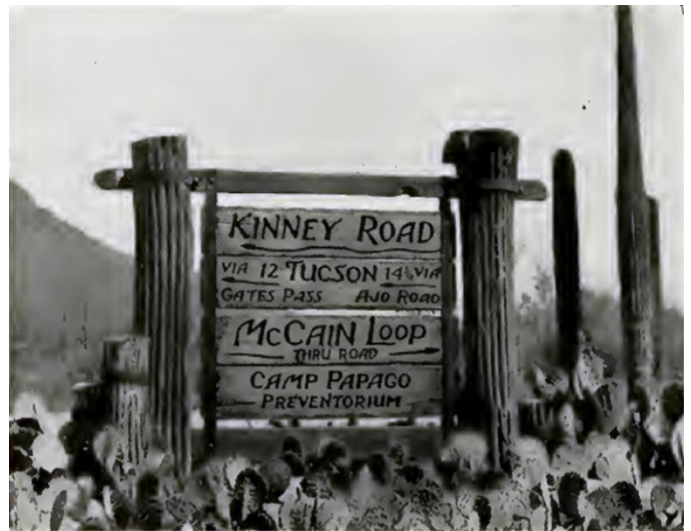
Historic photograph of CCC road sign. This one is labeled #12 on the accompanying map. Note saguaro rib posts, hand-wrought iron hardware, and hand lettering.

“successfully exemplify” this form were illustrated in Wood’s 1938 1 publication on NPS Rustic architecture. The signs, with their saguaro rib posts, hand wrought iron hardware, and hand lettering were created to blend in to the environment of the Sonoran Desert (see Resource Brief on NPS rustic style architecture).