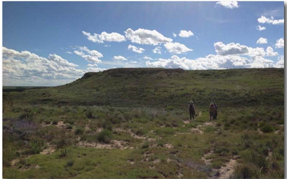
USFS and NPS staff walk a retracement trail in the Cimarron National Grassland.

The project consists of new and revised exhibits, pedestrian and road signing, and accessibility improvements at two trailheads. An additional trailhead is under consideration.