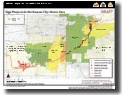
Kansas City Metro signing status map

Salem Park Interpretive Site SFTA, Jackson County Parks and Recreation staff, and NTIR selected a conceptual site layout for the new interpretive site at Salem Park, just east of Independence, MO. Progress is being made both on plans for paving and other site work to be completed this fall and winter, and on the collection of content for the new wayside exhibits. The site should be complete and open to the public by late summer 2016.