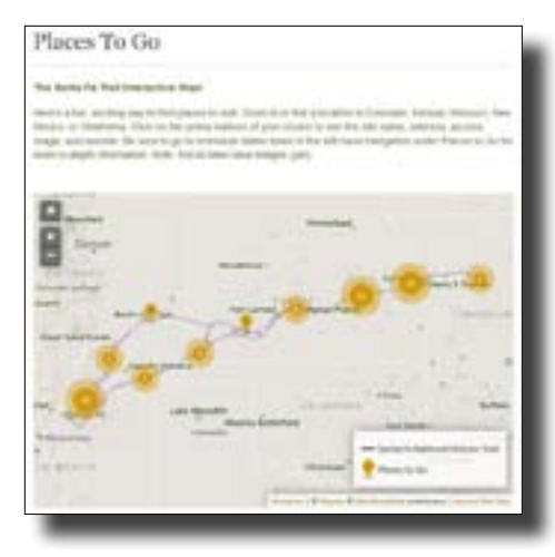
Plan Your Visit, Places to Go website

National Trails Intermountain Region (NTIR) recently finalized and launched a series of interactive maps highlighting places along the trail for the public to visit. The maps are featured on Places to Go and Passport Stamp web pages. Each state page on Places to Go also has a map.