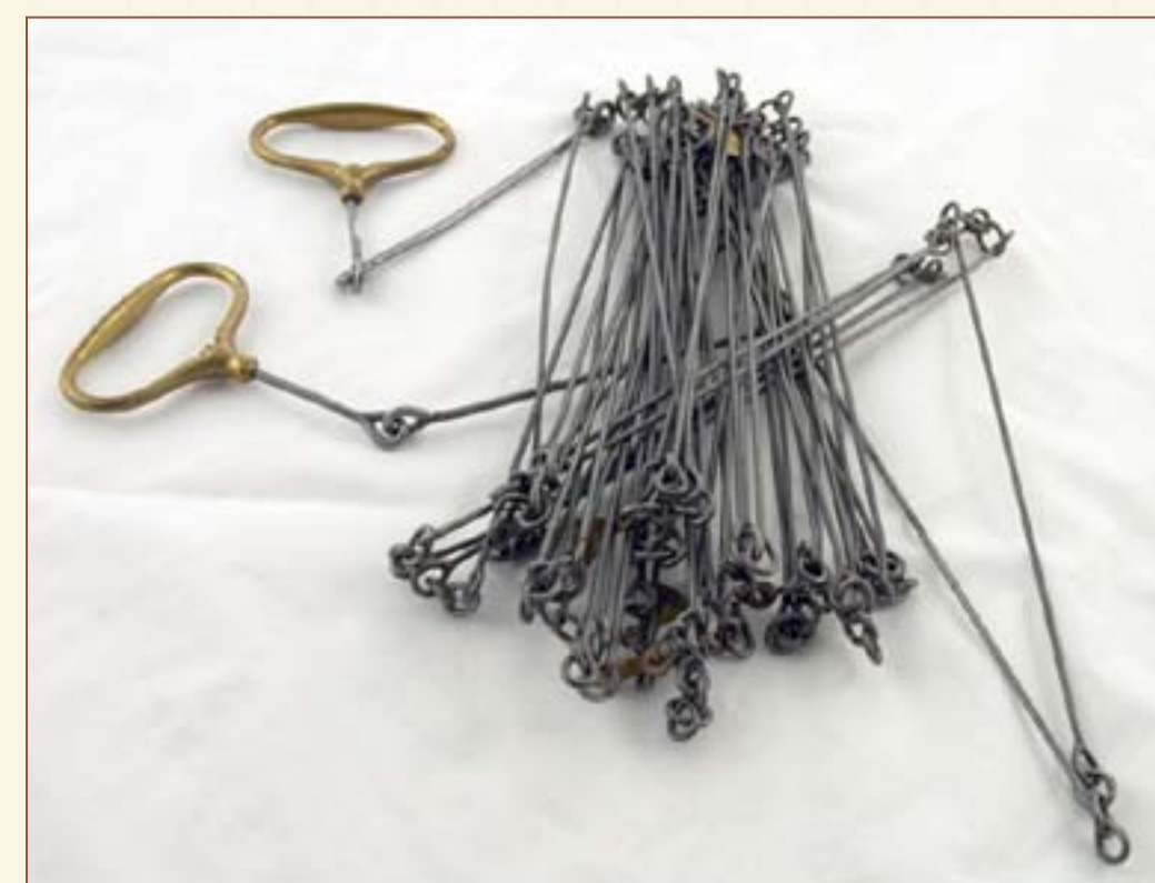
Star of the Republic Museum, Blinn College