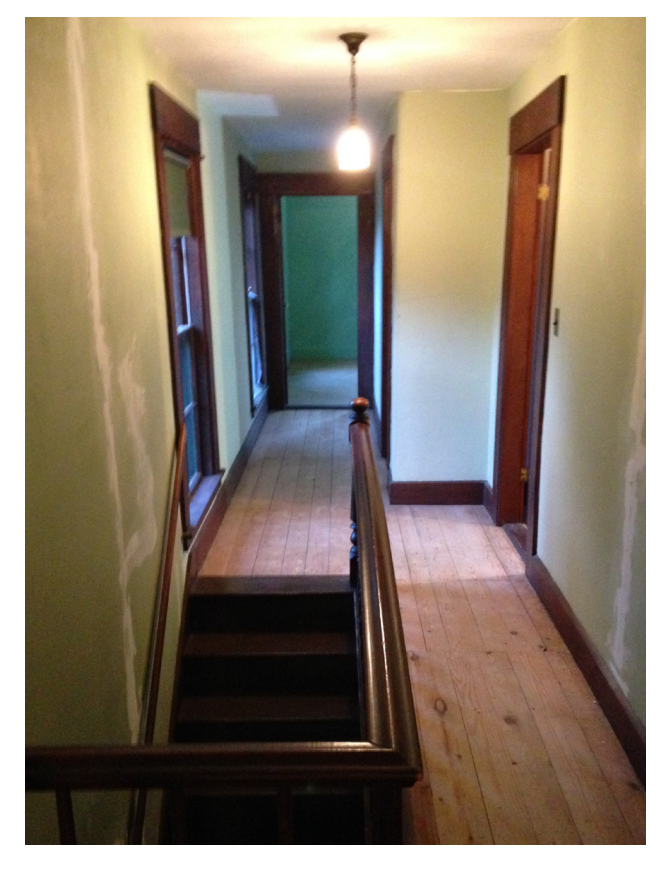
Second floor: back staircase, in the ell section of the house.