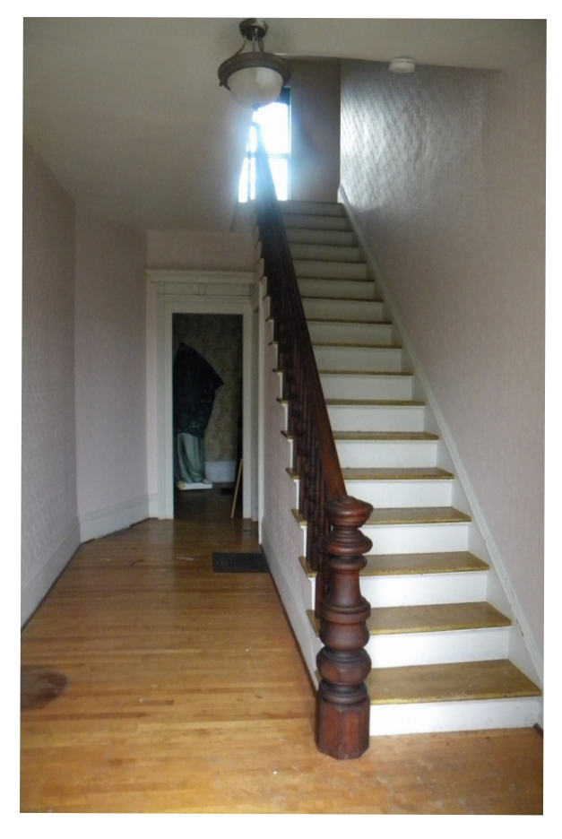
Entry hall and central staircase.