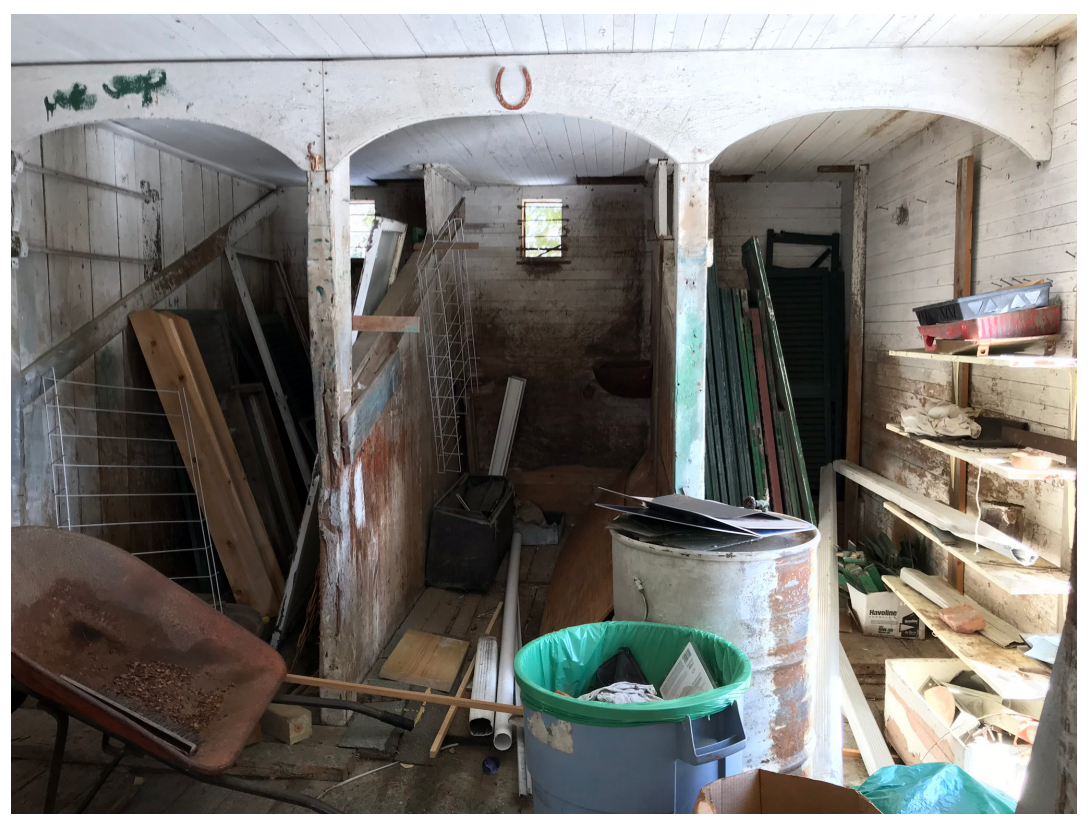
View of horse stables in the Barn/Garage.