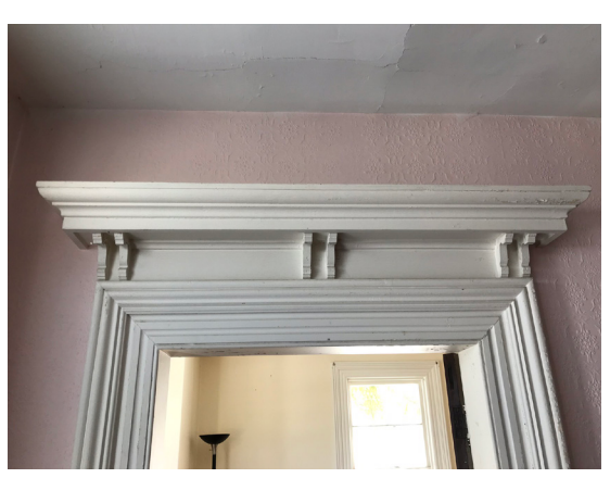
Detail over the door to the central hall.