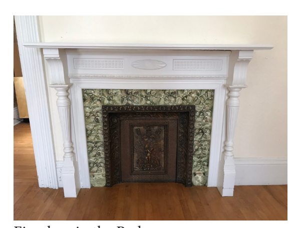
Fireplace in the Parlor.