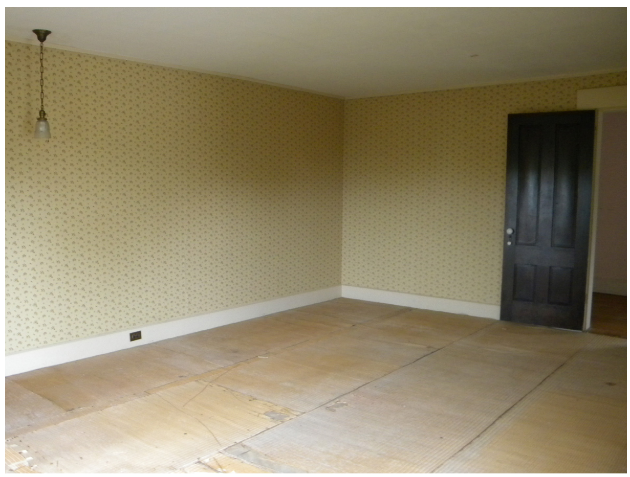
Bedroom on the second floor.