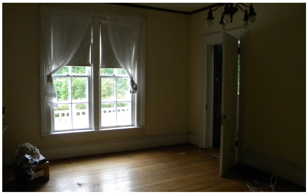
View of the Dining room on the first floor.