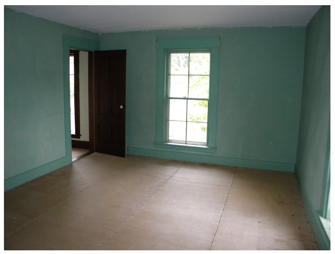
One of the second floor bedrooms.