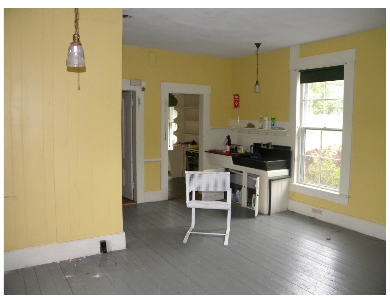
View of the Kitchen.