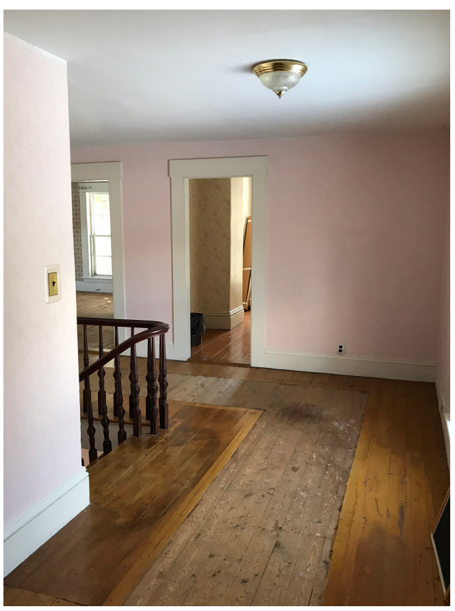
Second floor landing. At the top of the central stairs.