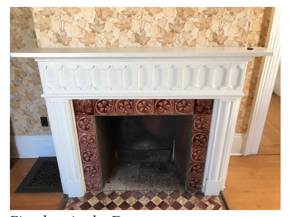
Fireplace in the Den.