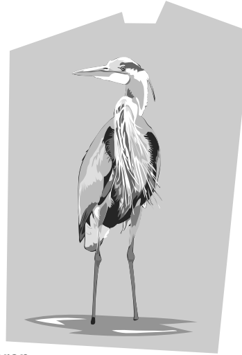
great blue heron

As you float the Namekagon River, you will likely encounter the majestic and elegant great blue heron. This blue-gray bird is often seen along the shoreline, where it stalks unsuspecting prey by standing or walking on its long, thin legs against the current. The heron uses its sharp beak to spear fish, frogs, snakes, dragonflies, mice, and other animals and then slides the meal headfirst down its throat. You may also see a heron flying over the river, slowly flapping its six-foot wingspan, neck tucked into an S-shape and legs trailing behind. A memorable sight!