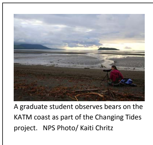
A graduate student observes bears on the KATM coast as part of the Changing Tides project.