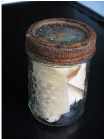
This jar with a note inside was found on the outer coast of KEFJ during the marine debris cleanup project. The note was written by a young student on Pender Island, B.C., Canada.