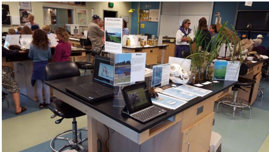
One of eight stations, each with demonstrations of scientific concepts, set up during a public Discover Lab conducted by Kachemak Bay Research Reserve.

schools 12 times (496 students served) and at the Alaska Islands and Ocean Visitor Center in Homer 7 times (435 public visitors served). A new CESU Task Agreement was executed with KBRR/UAA using FY15 money to fund a new Discovery Lab during the 2015-2016 school year. (Budget Line Item 16)