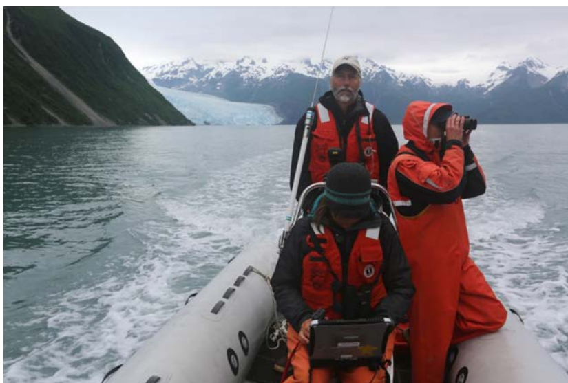
National Park Service and USGS scientists conduct a seabird survey in KEFJ.