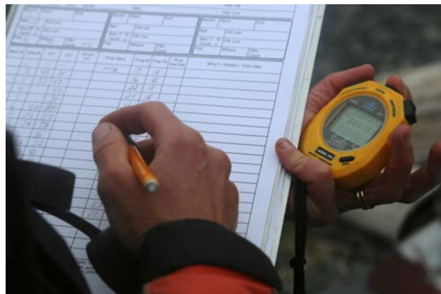
A researcher scribes observations of sea otters diving and feeding in KEFJ in order to determine diet and energy intake, and ultimately estimate population size.