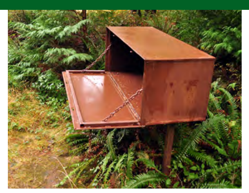
Food storage lockers (at each site)