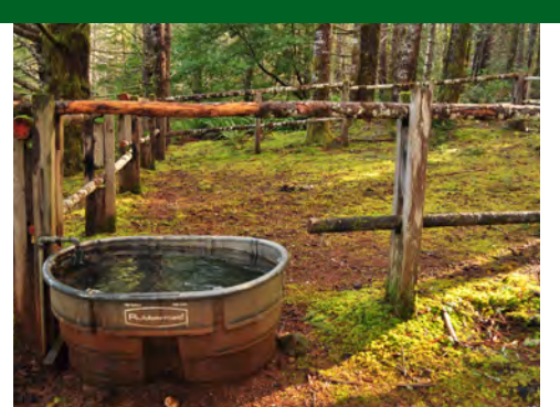
Stock-friendly: corral & trough avail.