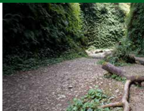
Hike Fern Canyon