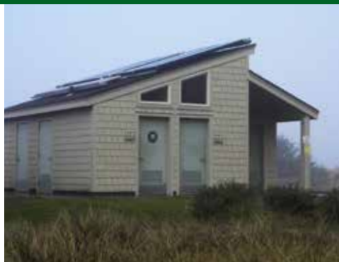
Restroom and showers