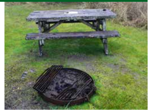
Picnic table & fire ring