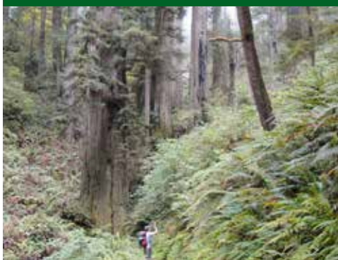
Hike through old-growth forest