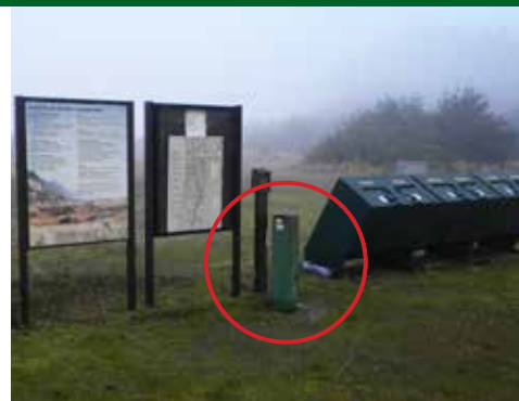
Self pay station