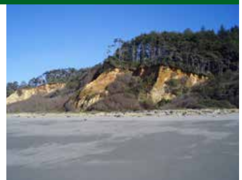
Stroll along Gold Bluffs Beach