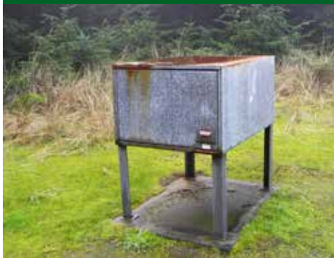
Food storage locker