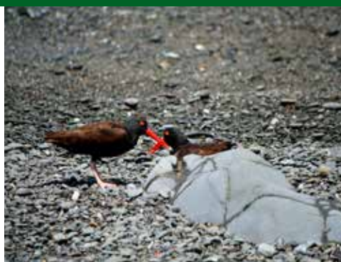
Birding on the Beach