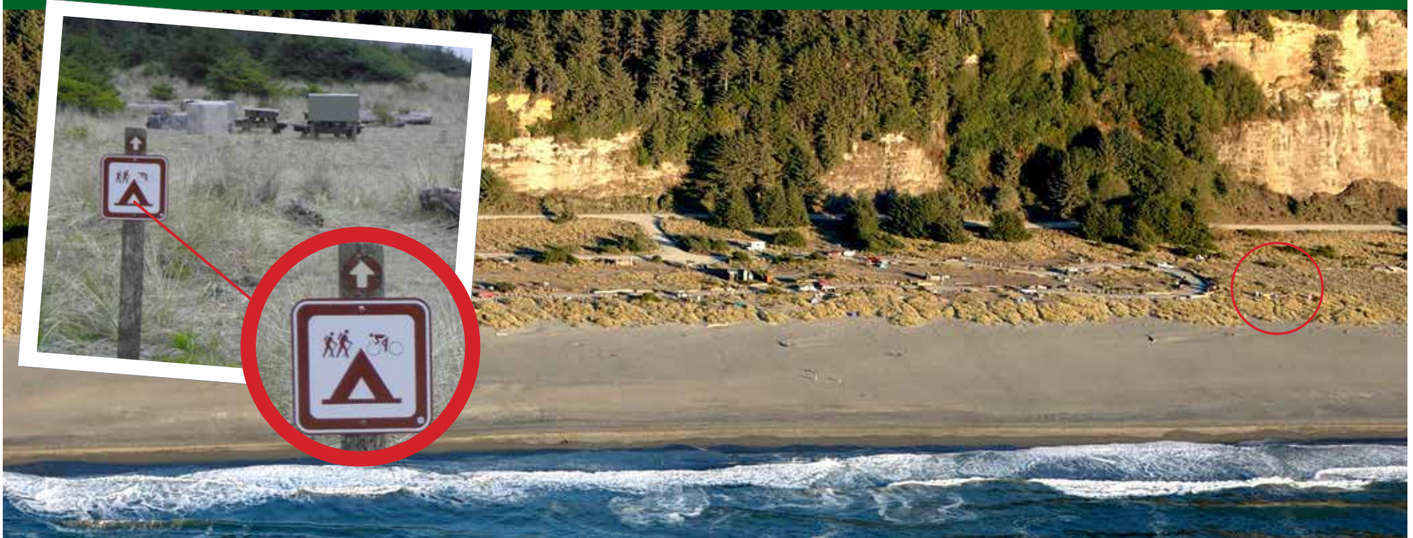
An aerial view of Gold Bluff Beach Campground