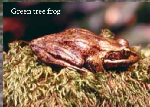
Green tree frog