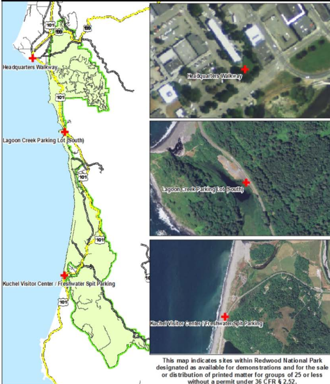
First Amendment Sites Redwood National and State Parks National Park Service