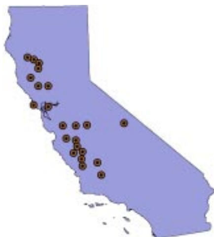
1998 Population: 3,200