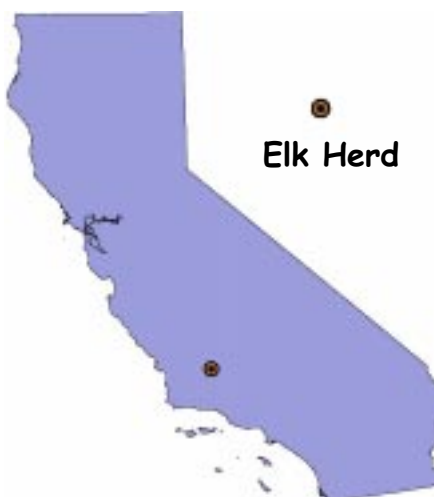
1870 Population: fewer than 10