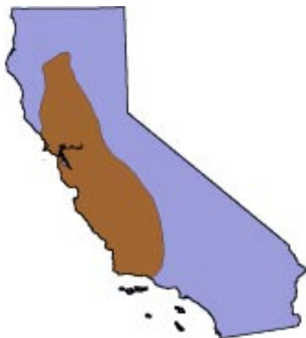
Historic Tule Elk Range Population: 500,000